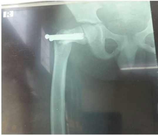
Figure 1: X-ray showing failed percutaneous pinning with two cannulated screws post op day 10.