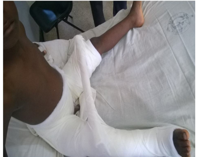
Figure 4: child sitting comfortably in bed with a hip spica post re-op.

This occurred in the 8-year-old boy who had his falling school wall landing on the right thigh whilst playing at school (Figure 2). He had closed reduction and percutaneous pinning with 2 cannulated screws without hip spica. Child was doing well post operatively on the ward until day 10 when he suddenly sat upright in a chair to receive lessons from the school teacher. He was in sudden excruciating pain and subsequent repeated radiograph confirmed the cut out of the cannulated screws (Figure 1). He later had closed reduction and percutaneous pinning with two 2mm-Kirschner wire and No. 5 TiCron tension band as well as hip spica applied after previous screws removed (Figure 3 & 4).