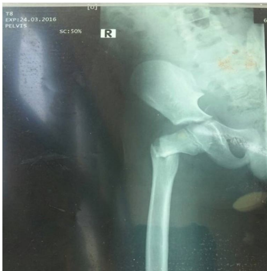
Figure 2: X-ray showing displaced cervico-trochanteric fracture of the right femur.