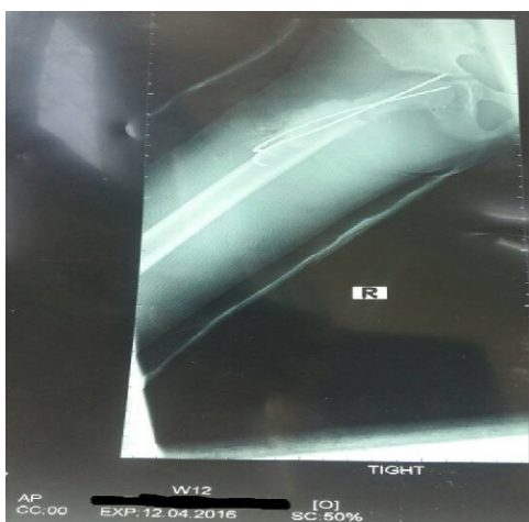
Figure 3: Post re-op x-ray showing two 2mm kirschner wires and hip spica.

This occurred in the 8-year-old boy who had his falling school wall landing on the right thigh whilst playing at school (Figure 2). He had closed reduction and percutaneous pinning with 2 cannulated screws without hip spica. Child was doing well post operatively on the ward until day 10 when he suddenly sat upright in a chair to receive lessons from the school teacher. He was in sudden excruciating pain and subsequent repeated radiograph confirmed the cut out of the cannulated screws (Figure 1). He later had closed reduction and percutaneous pinning with two 2mm-Kirschner wire and No. 5 TiCron tension band as well as hip spica applied after previous screws removed (Figure 3 & 4).