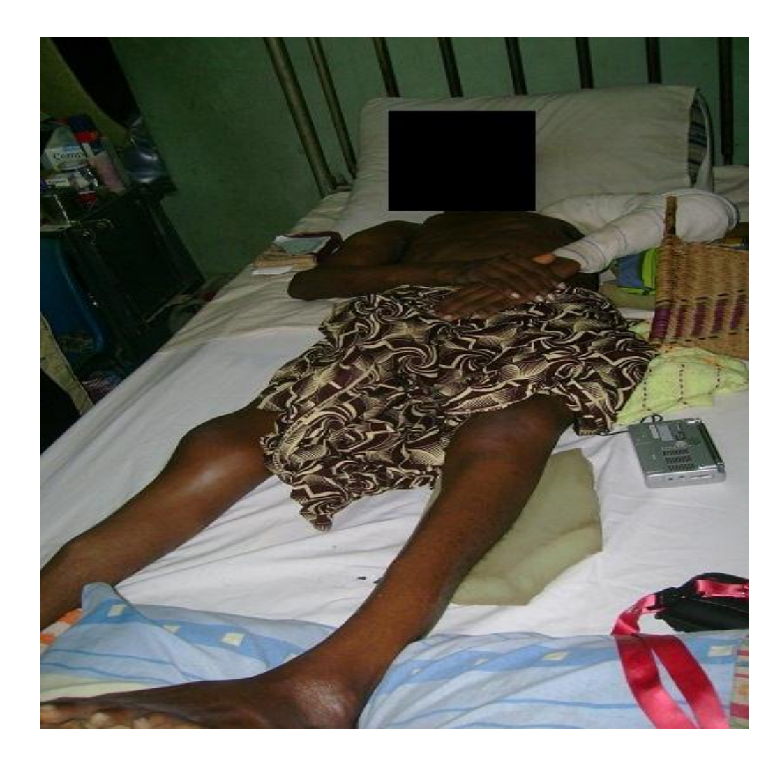
Figure 1: Physical findings at first contact with general surgeon