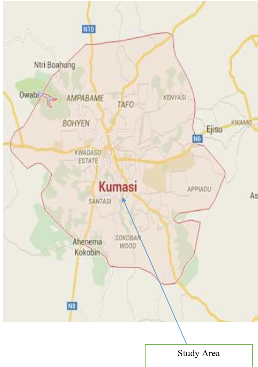
Figure 3: Map of Kumasi Metropolis