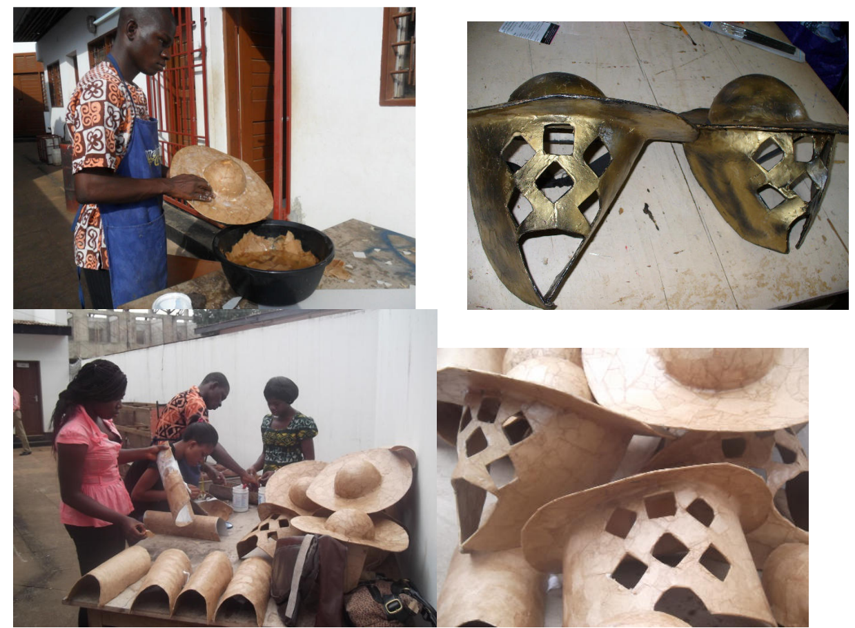
Costumiers creating shin guards