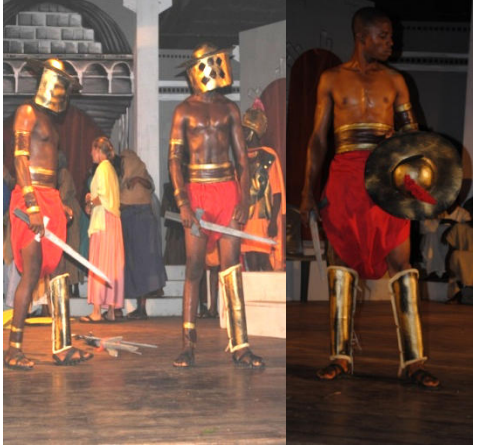
Fig. 1, Actors playing the role of in improvised costumes

Ancient Roman gladiators as found in Androcles and the Lion were well built men who fought even to the point of death to entertain Caesar and spectators. These gladiators were seen to be terrifying and even harmful though they were cherished and respected in the society. As part of their original costumes (as seen in Fig 2), they wore helmets and shin guards made from metal. Their foot wear was a pair of crossed sandals made from animal leather. Their nudity was covered using strips of woolen of fabric. Figure 1 show gladiators whose costumes were crafted form local materials from Ghana. Creating similar costumes for the gladiators to look like the original ones, the costumiers used gourd (calabash), straw board and paper to build the helmet while straw board, foam and papers were used to build the shin guards. To make these items have that metallic look, the costumiers sprayed them with bronze paint. Their improvised foot wear was made using discarded car tyres which were cut and shaped to look like the original types which have cross straps. The nudity of the gladiators was covered using red polyester fabric. The red colour revealed their aggressive and dangerous nature. In order to make these gladiators look very sweaty, shear butter was smeared on their bodies. Below in figure 1 is a picture depicting the gladiators costumed for the play in Ghana. Fig 2 is a pictorial format of Ancient gladiators.