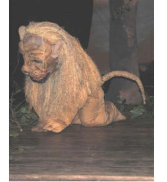
Fig. 3 An actor in an improvised

The lion is an animal which lives in the forest and later became a friend to Androcles. Their friendship comes about when Androcles, a lover of animals, removes a thorn from the lion's right paw in the forest. Because the lion is a wild animal that lived in the forest and cannot be brought on stage, the costumiers used some local materials to build its costumes as seen in fig 3. The costumiers employed polyester fabric, foam, metal gauze and raffia skirts which they cut and glued together to create costume for the actor to play the role.