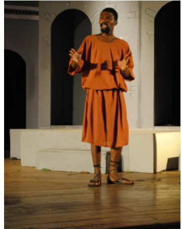
Fig. 5 Androcles in an improvised chiton

As discussed earlier on, some ancient Greek men wore chitons similar to the Roman tunics with leather sandals which have straps laced on the wearer's shin as foot wear. Androcles' improvised costumes (Fig 5) were a short brown chiton girdled at the waist and a pair of sandals. The chiton was made from polyester fabric instead of wool. His humility was revealed by the brown colour of his costume. For his sandals, he was given a pair of black rubber slippers which had cords attached to them. These cords were laced on his shin, something similar to the Greeks. To make the actor assume the age of thirty five, mustache and beard were fixed to his face. This was because the actor was twenty years old with a young looking face.