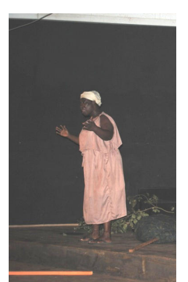
Fig. 7 Magera in an improvised chiton

4.5 Other Pictures of Improvised Costumes