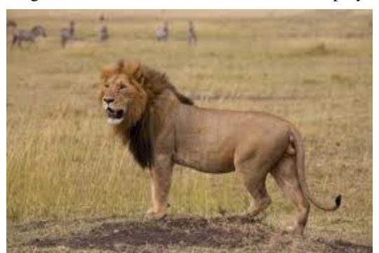
Fig.4 Pictorial format of a lion, costume of a lion https://www.google.com.gh/search?q=lion&source