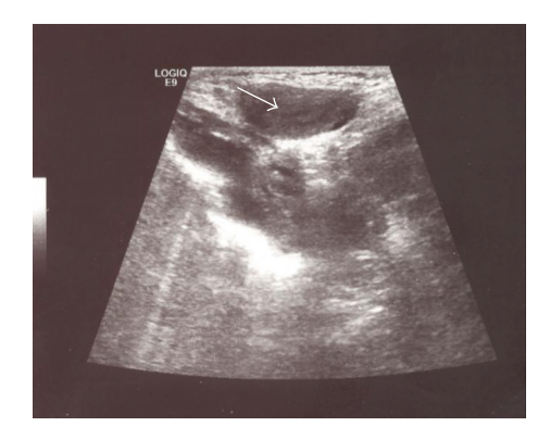
FIGURE 1: Ultrasonography image: a solid mass in right inguinal channel with a clearly visible endometrial lining.