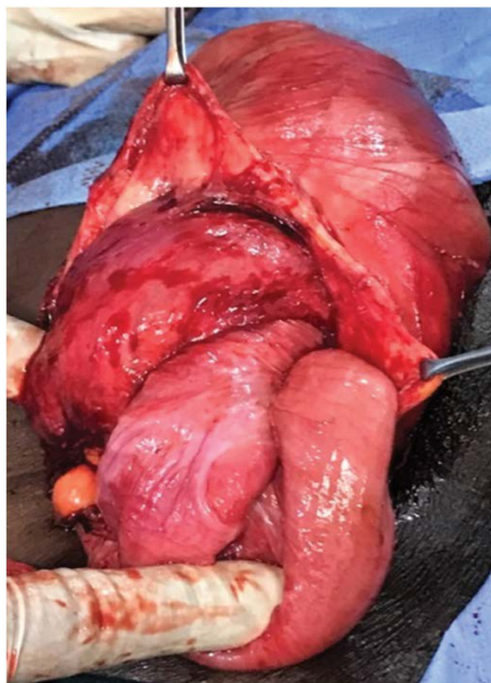
Figure 2: Opening of the hernia sac revealing the small bowel with the tumour.

deliver the sac and scrotal contents into the wound (Figure 1). As the testicle was normal in appearance, the sac was opened in order to inspect its contents. A bowel segment was firmly attached to a fleshy lesion measuring about 7 cm in diameter adjoining the testicle (Figure 2). The testicular appendage was divided and the small bowel adherent to the sac via fibrinoid adhesions was resected with end-to-end bowel anastomosis in two layers using 2/0 Vicryl and 4/0 PDS respectively. The testis along with the hernia sac was resected and the hernia defect closed using 2/0 Vicryl. A modified Shouldice repair was performed using 2/0 Nylon. He was well enough to self-discharge two days later and was well when seen two weeks postoperatively.