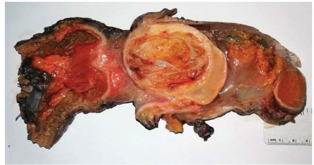
Figure 3: Gross photograph of paratesticular lesion with a central cystic/myxoid degeneration.

The resected specimen consisted of a fibrofatty