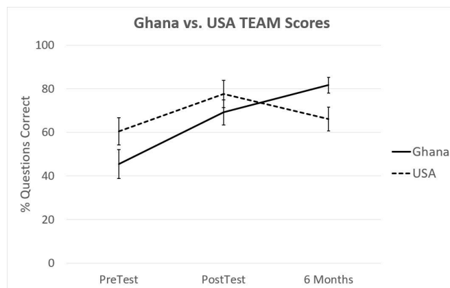
Figure 1 Pre-course, post-course and 6-month follow-up test scores, by country (mean±SD).

*Significant difference between countries ( p < 0.05 ).