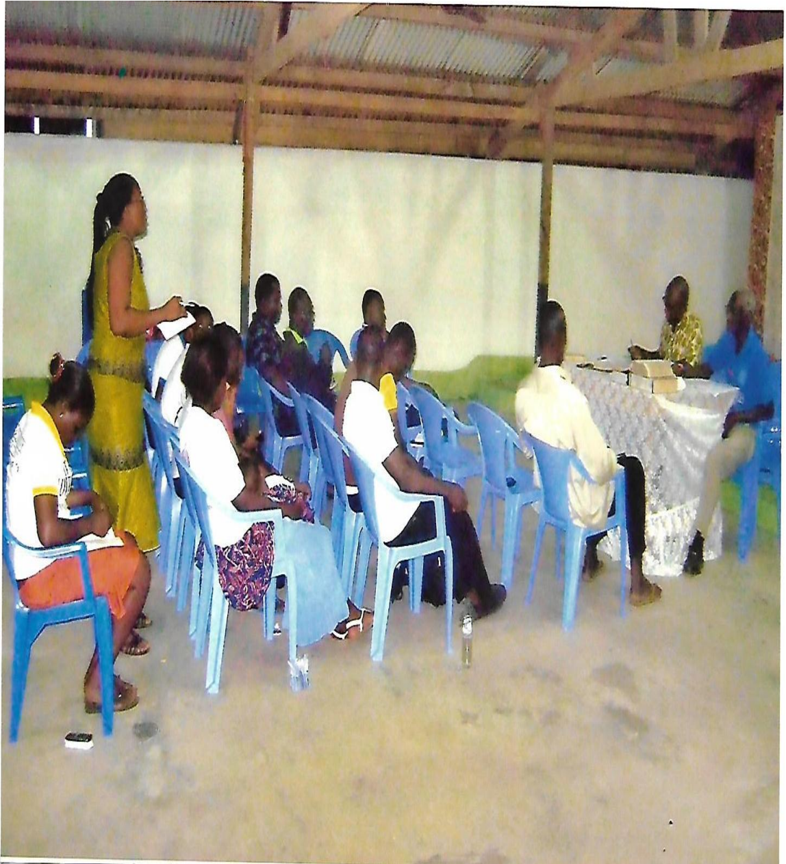
PLATE 2: A CROSS SECTION OF THE PARTICIPANTS OF THE C.B.S. AND THE RESEARCHER AT AŊLOGA.