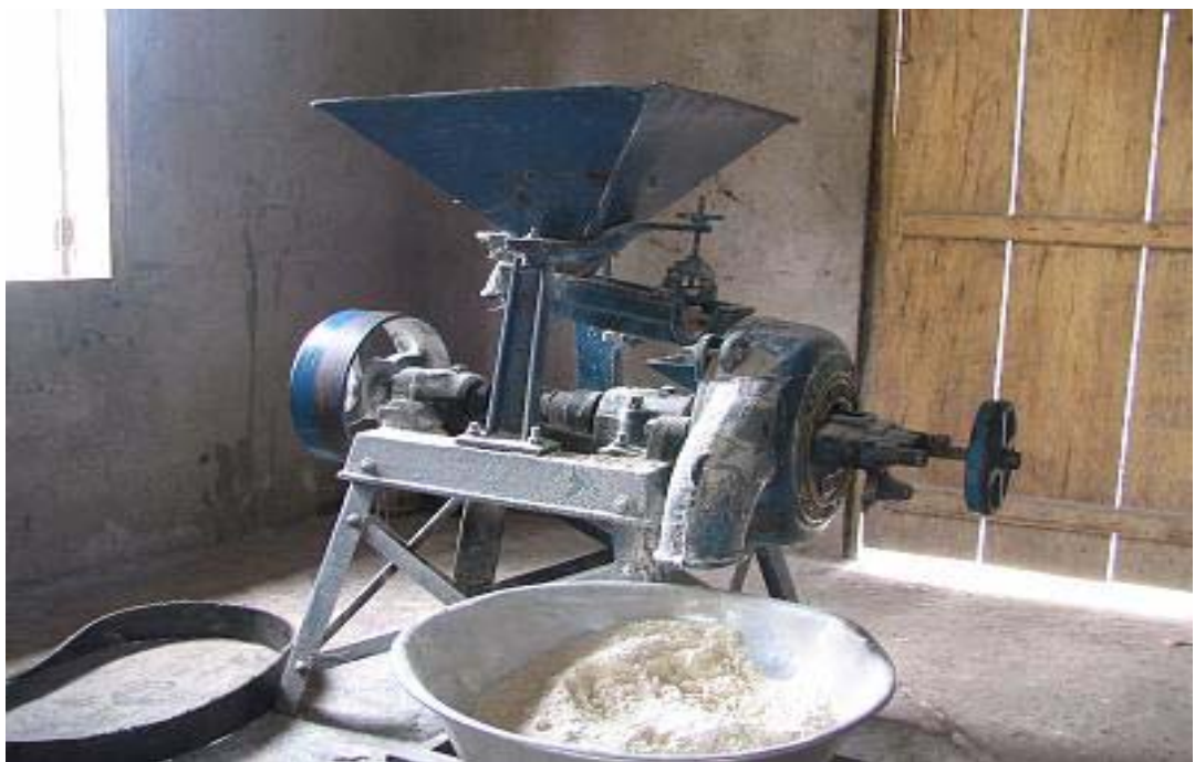
Plate 4: A student doing dressmaking in the vocational school