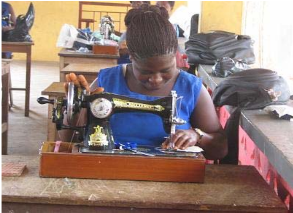
Plate 5: Corn milling centre in Abakam