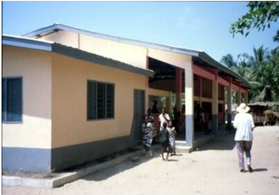
Plate 1: CRAN's vocational school building