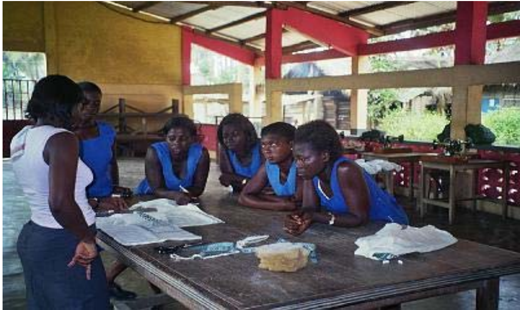
Plate 3: Vocational school students conferring with an instructor