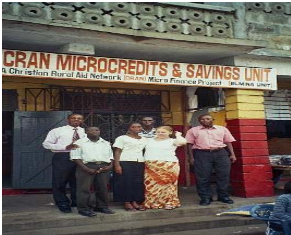
Plate 6: Micro Credit Unit