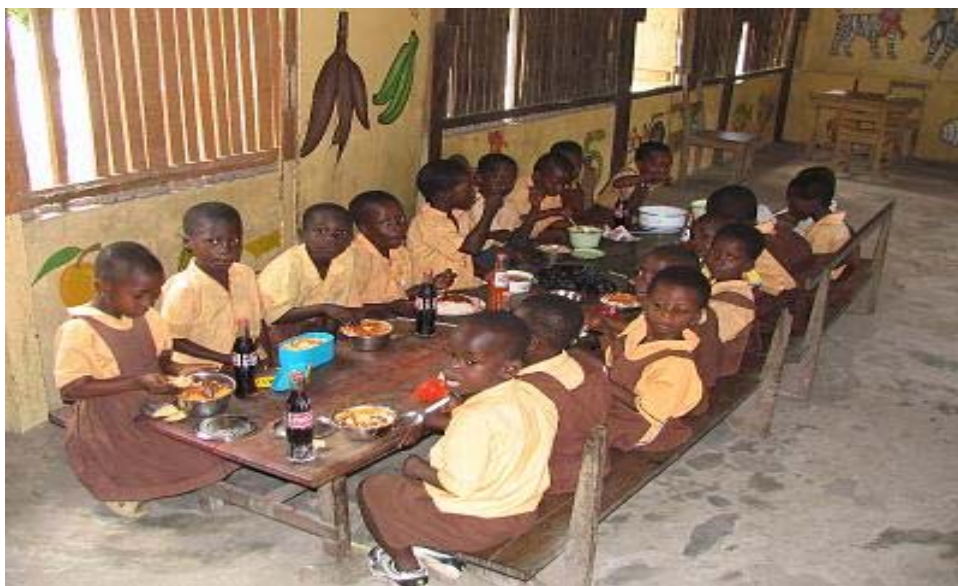
Plate 2: Pupils being refreshed by CRAN