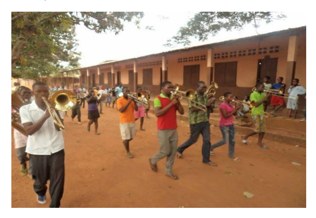
Figure 1: Nunya Music Academy band

where they are giving special training to children interested in playing any wind instrument. The academy has a well organized regimental band that performs at various events. Below are two pictures of the Nunya Music Academy band.