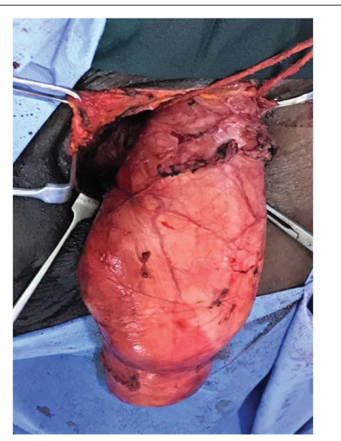
Figure 1: Delivery of hernia sac with scrotal content into wound.