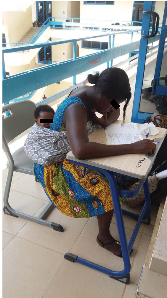
Figure 2: Female student with a baby at a face-to-face session.

From Table 3, F(1, 376) = 12.107 was significant at p < .01 . This meant that family roles were positively related to persistence of female students. Therefore, the null hypothesis that stated that there is no statistically significant relationship between family roles and persistence of female students in distance education programmes in Ghana was rejected. The implication of this finding was that despite the fact that there was some increase in the level of family roles female students performed, their persistence increased as well as depicted in Figure 2.