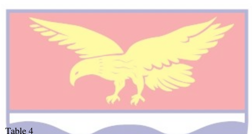
Frequency and Percentage of Symptoms Experienced by Study Participants

Research Question One: Which symptoms are experienced by women working in schools under Ibadan North Local Government area of Oyo State Universal Basic Education Board during menopausal period?