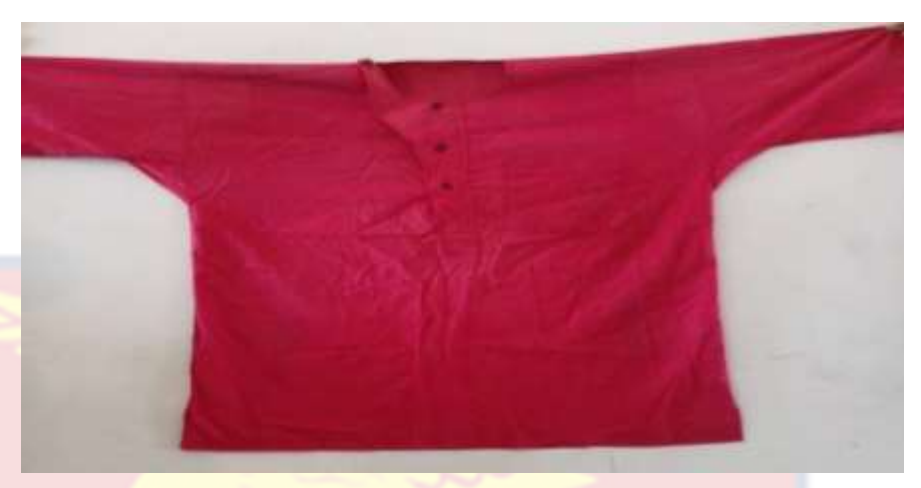
Figure 9: Red jumper