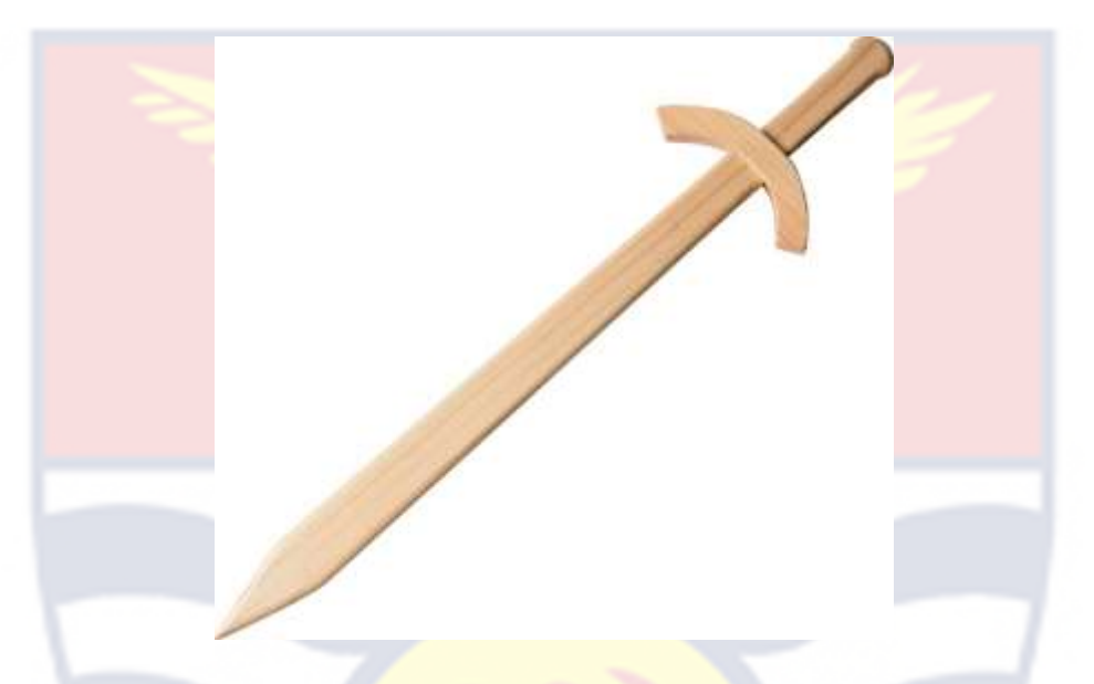
Figure 11: Wooden sword

Red cloth is tied at the waist on the tsaka to strengthen the waist. (Current dancer in Kedzi)