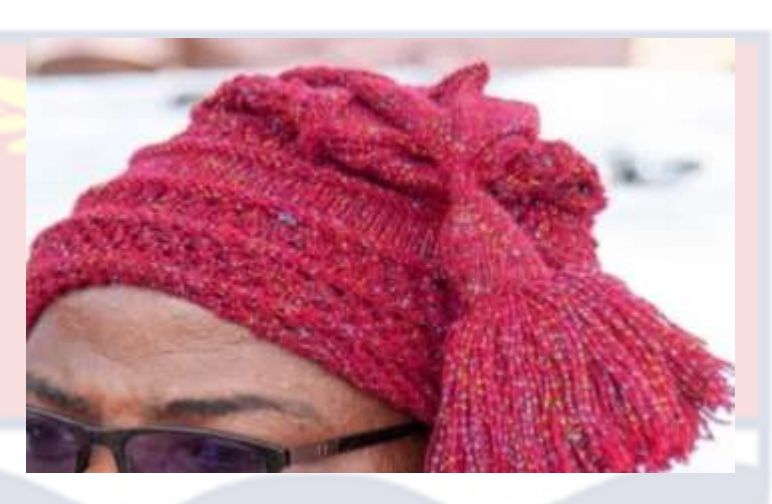
Figure 13: Togbenya (Hat)

The dancers also carry horse tail (dancing whisk) known in the local language as "adedzo" or "sortsi" while dancing (a 35-year-old current dancer).