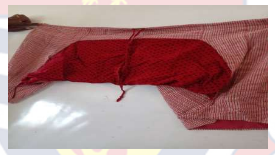
Figure 8: A picture of the Tsaka (Knicker) Source: Field data, 2021from Anloga

Data collected revealed that, overtime, there were some changes in the Atsiagbekor dance costume. The dancers and/designers have tried several designs. In this study, the focus was on the costume mostly used by most of the contemporary dance groups. The contemporary costume contains the following features: tsaka, red jumper, red cloth, wooden sword, horse tail and a hat.