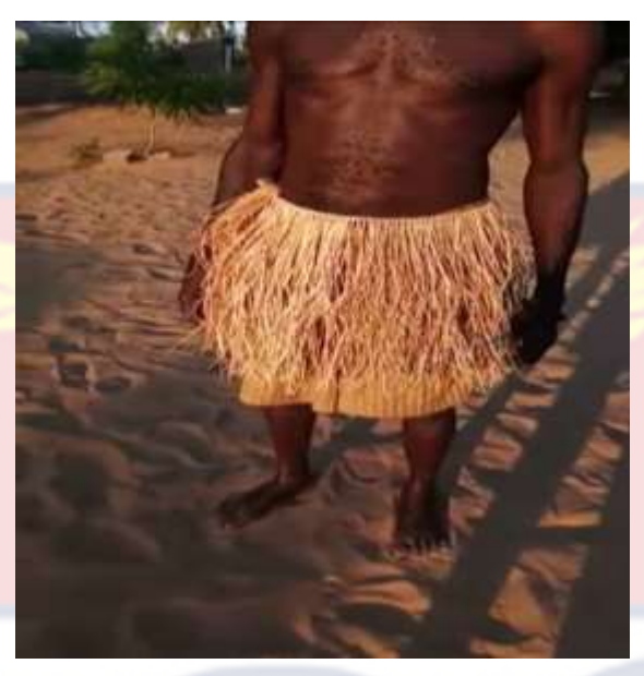
Figure 3: The raffia skirt