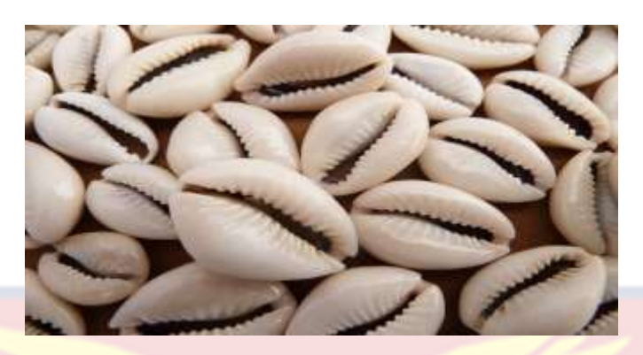
Figure 7: Cowries from the sea shore