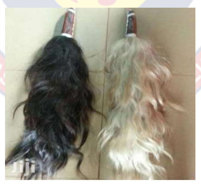
Figure 12: Horse tail

The wooden sword replaced the cutlass and is used to depict war movement (current dancer in Anloga)