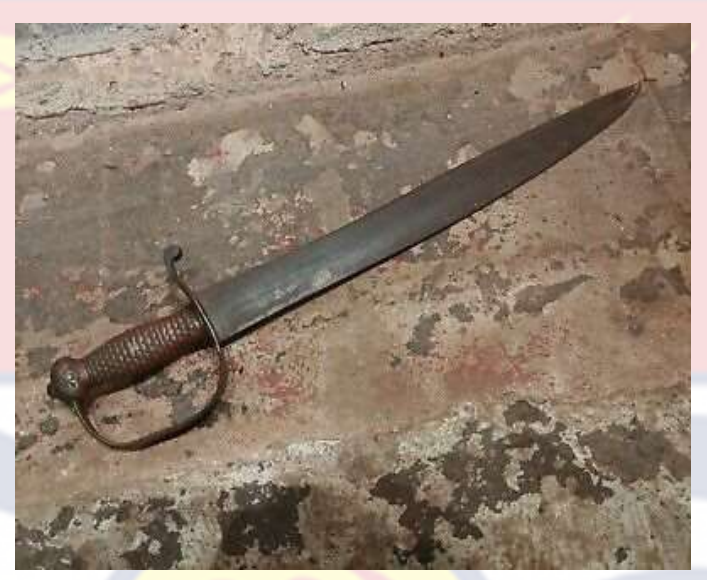
Figure 4: Cutlass

The warriors needed bullets but couldn't just hold them in their hands, so they hid them in the belt made from animal skin and tied around their waist for easy access.