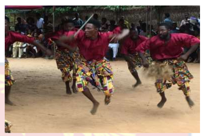
Figure 15: Another contemporary Atsiagbekor costume

Due to COVID19, the researcher did not get original pictures from the community where Atsiagbekor is performed in traditional context. The above pictures were therefore retrieved from the internet considering the descriptions from the participants.