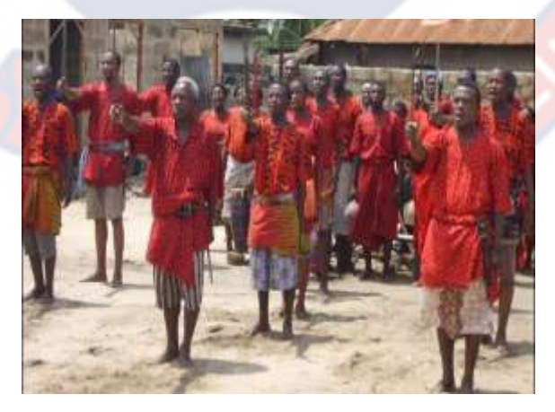
Figure: 14: The contemporary Atsiagbekor costume

The hat (togbenya) is a special type of hat in the Anlo culture worn by the lead dancer. Togbenya is an Anlo traditionally knitted hat which is worn over the head to cover the ears. It is knitted with 2 sticks with yarns. It is usually worn by the leader in front of the dance troupe. (a 65-year-old retired dancer in Anloga)