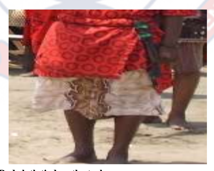
Figure 10: Red cloth tied on the tsaka

The women, who usually constitute the singing part of the performance, wear simple kaba or tie a red cloth around the top of their breast and extend it down below their knees. This distinguishes the men from the women. (52-year-old current dancer in Kedzi community)