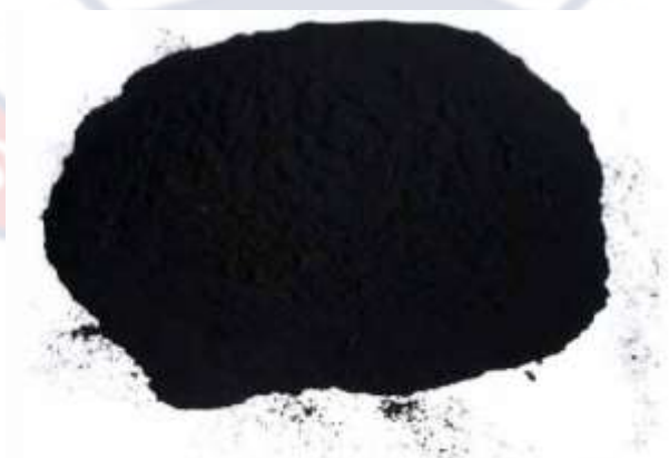
Figure 5: Black powder

The dancers use gun and cutlass to depict the actions that took place on the battlefield and how they were able to defeat their opponents. (60-year-old retired dancer in Kedzi).