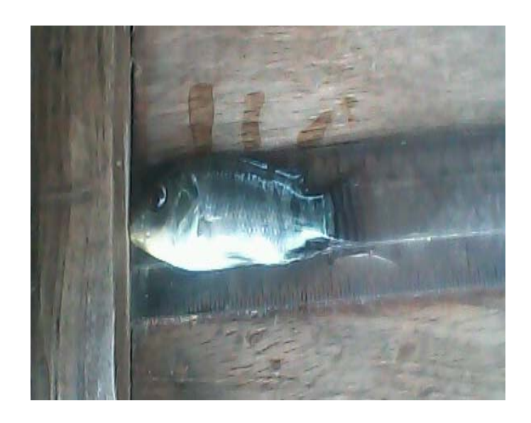
Plate 3: Initial size of fingerlings of O. niloticus at stocking was 7 g of 6 cm standard length and 7.5 cm of total length

parameters not calculable for, because no supplementary feed was given. Similar superscript alphabets in the rows denote homogeneous means (LSD, P > 0.05)