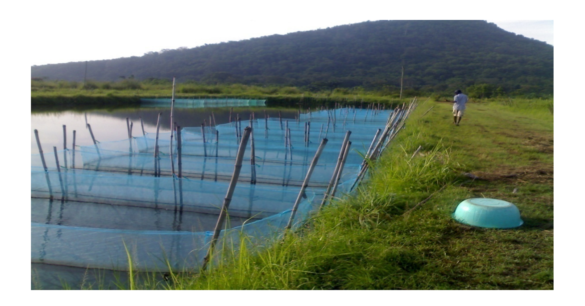
Plate 2: Experimental set-up showing the hapas mounted in a 0.2 ha pond for O. niloticus fingerlings