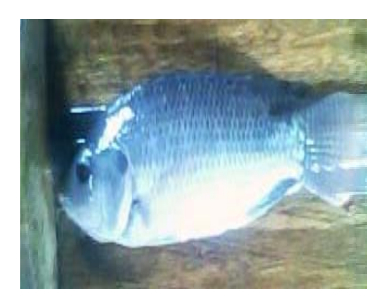
Plate 6: Maximum size of O. niloticus fed on diet 3 after 6 months of culture was 121 g of 15 cm standard length and 18.9 cm of total length