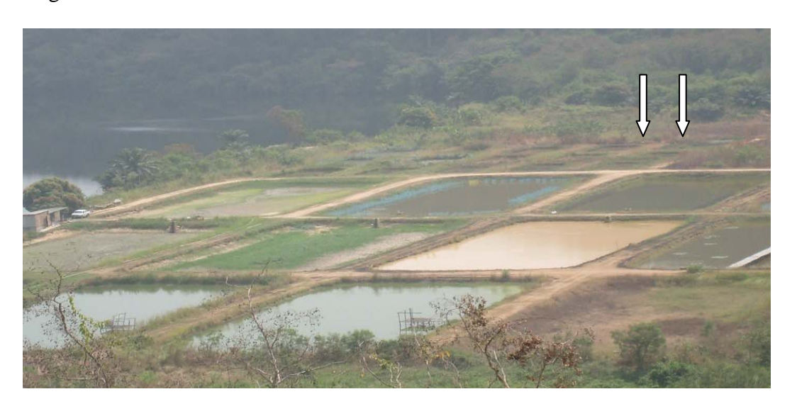
Plate 1: Aerial view showing the layout of the ponds at the site where the study was carried out

The study was conducted at the Aquaculture Research and Development Centre (ARDEC) of the Water Research Institute (WRI) of the Council for Scientific and Industrial Research (CSIR) at Akosombo in the Eastern Region of Ghana from October 2010 to March 2011. Aquaculture Research and Development Centre (ARDEC) lie between the latitude 6 ° 13 ' North and the longitude 0 ° 4' East.