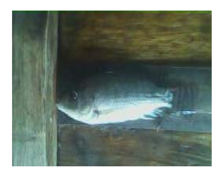
Plate 8: Maximum size of O. niloticus fed on diet 5 after 6 months of culture was 18 g of 8 cm standard length and 10.2 cm of total length