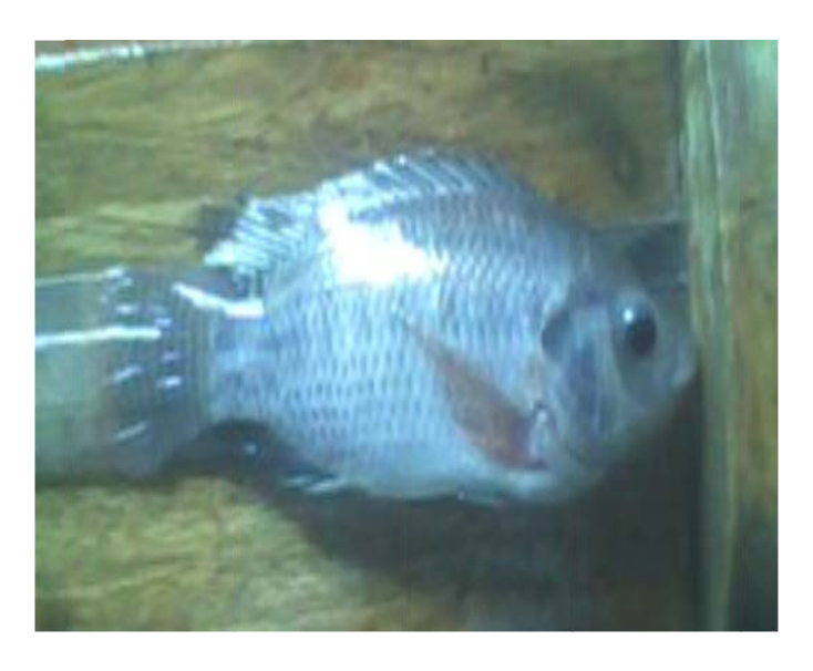
Plate 5: Maximum size of O. niloticus fed on diet 2 after 6 months of culture was 90 g of 13.9 cm standard length and 17.6 cm of total length