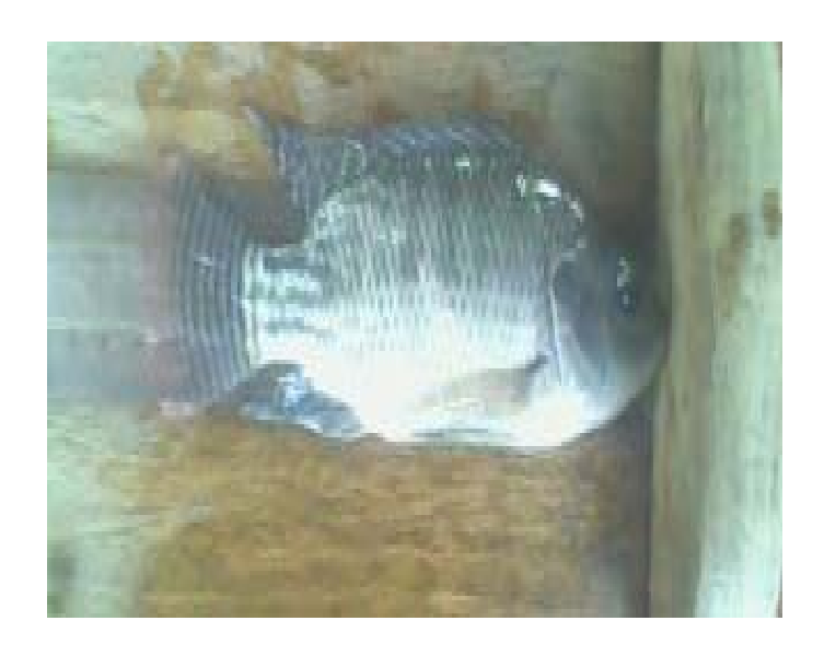
Plate 7: Maximum size of O. niloticus fed on diet 4 after 6 months of culture was 86 g of 14 cm standard length and 17.3 cm of total length