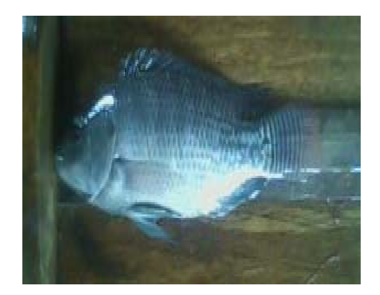
Plate 4: Maximum size of O. niloticus for diet 1 after 6 months of culture was 132 g of 15.5 cm standard length and 18.9 cm of total length