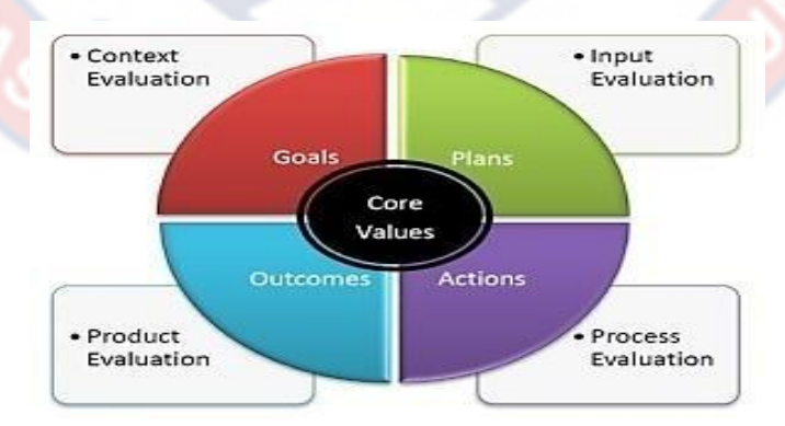
Figure 1: (CIPP) model "Adopted from" Amberhartwell A journey through Evolution of Educational Task design

This model is represented by the abbreviation CIPP (Context, Input, Process, Product). In 1971 a Phi Delta Kappa committee chaired by Daniel Stufflebeam was set up to address the weaknesses that exist in Tyler's objectivecentred model. The committee findings came up with a new version of the model called the context input process product (CIPP) to address weaknesses in Tyler's model. This model is accepted globally and used by educationalists due to its smooth evaluation process. One contributing factor of this model is the importance attached to evaluative data for making a decision and providing remedies to the identified problem which is a deficiency in Tyler's model.