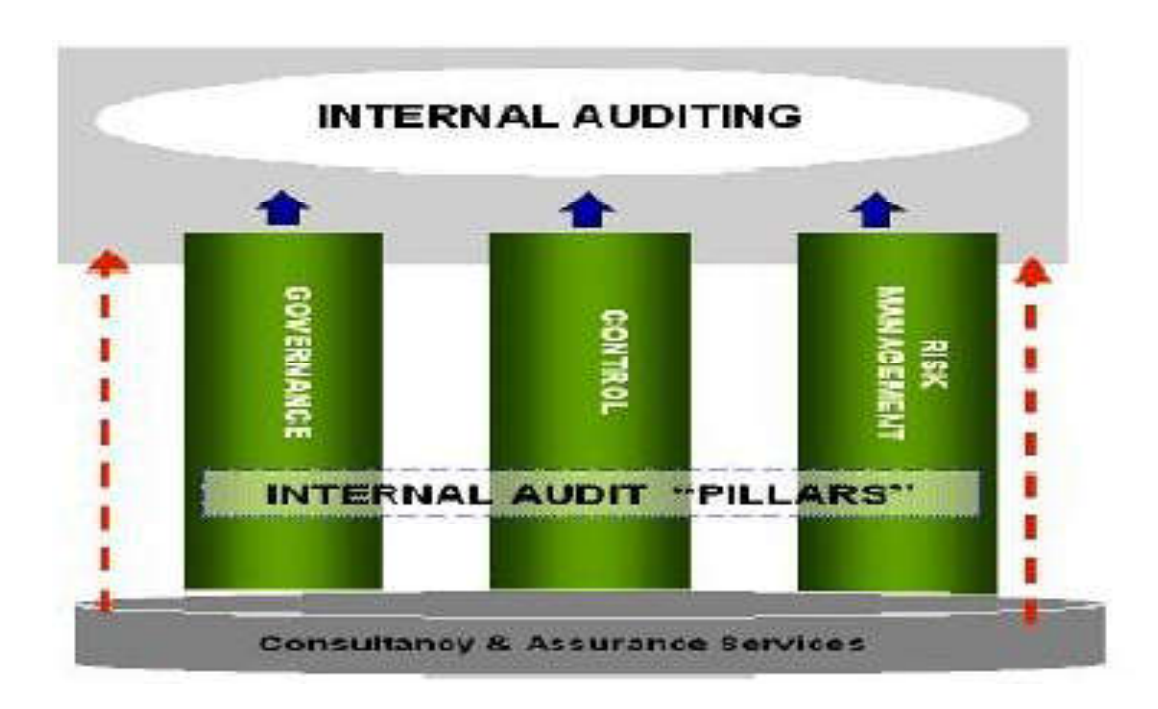
Figure 3 Three pillars of internal auditing