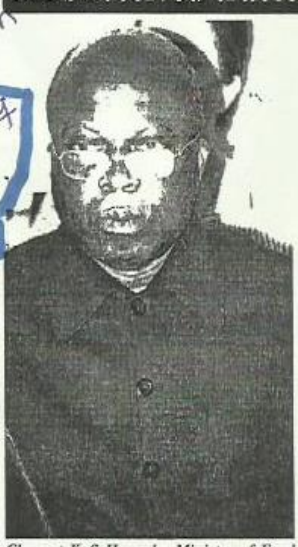
Clement Kofi Humado, Minister of Food