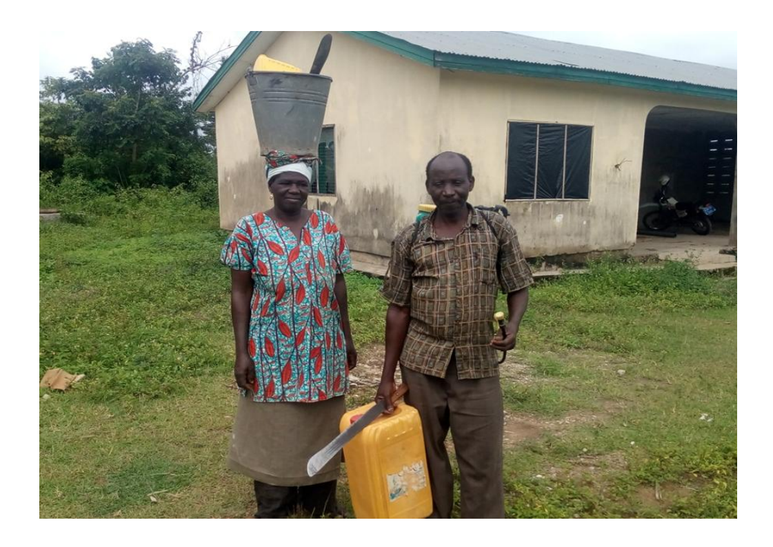
Figure 3: A couple going to farm, with the woman carrying a bucket, and the man carrying knapsack for fertilizer application and a cutlass.

usually provide water for mixing the chemical whereas men are in charge of the spraying of the fertilizer. The male participants stated that they educate the women on how to spray but they usually do the spraying because of women's time demands arising out of their reproductive roles. Other activities assigned on a gendered basis were planting, crop harvesting and marketing for women, and weeding and mounds making for men (see Figure 3).