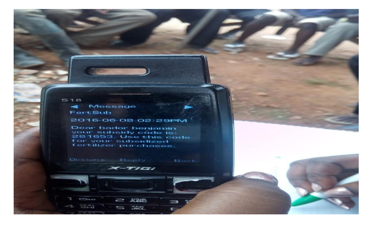
Figure 4: A message indicating the code for fertilizer subsidy

Almost all the female participants had phones; however, most of them depended on relatives for information from the organisations. One of the male FGD participants mentioned the nature of support they give to women regarding accessing to information.