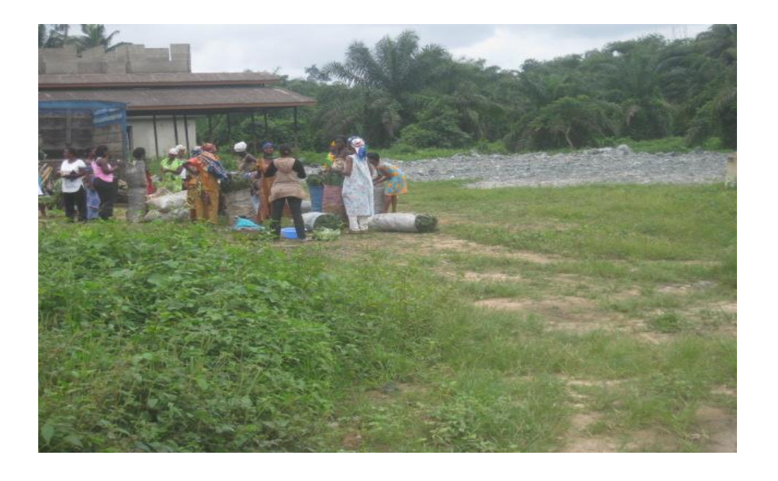
Figure 8: Mpohor Market

GSWL's interventional initiative, activities are very lively at the market place with no apprehension for flooding. Figure 8 shows a picture of the project.