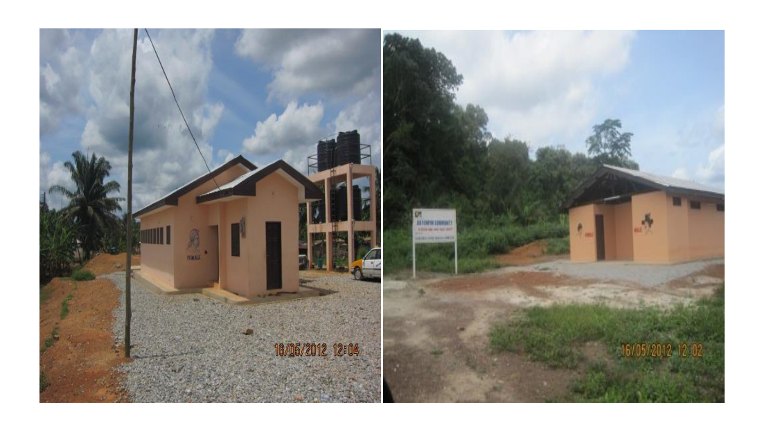
Figure 9: Akyempim Aqua Privy Fig. 10: Mpohor WC Toilet Facility

Source: Field Survey, 2014. Source: Field Survey, 2014.