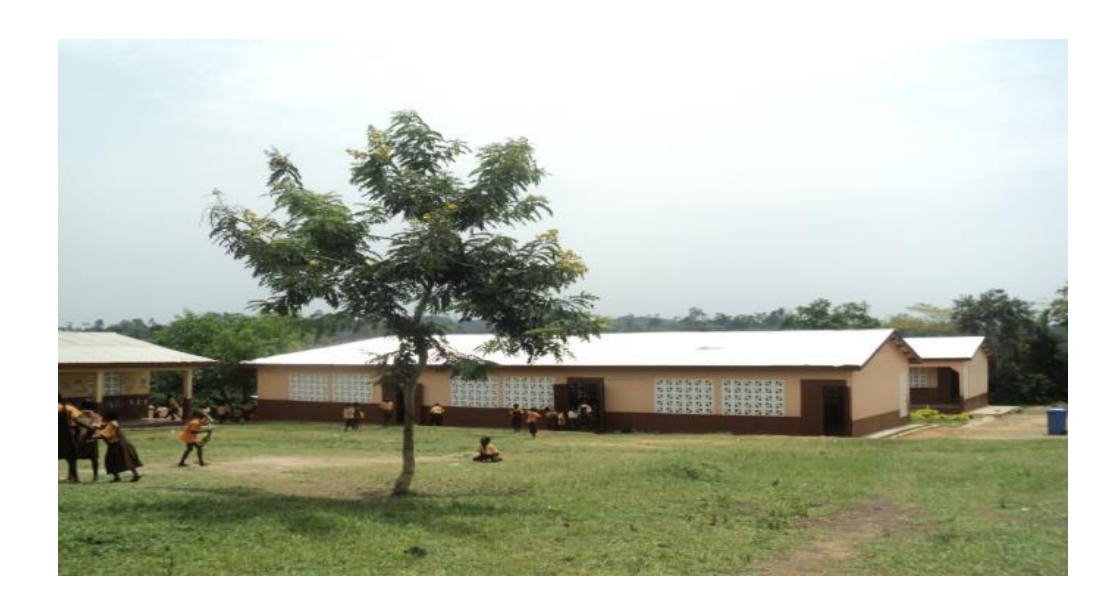
Figure 4: Akyempim 6 Unit Classroom Blocks