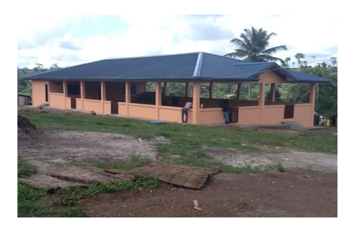
Figure 3: Subriso Community Centre