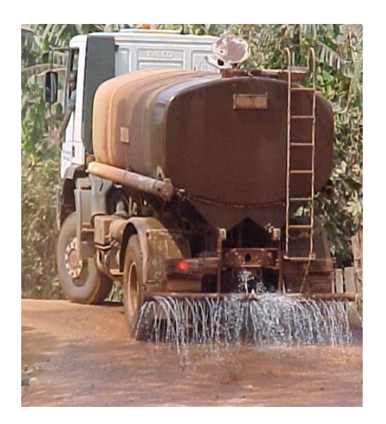
Figure 6: Water Boozer