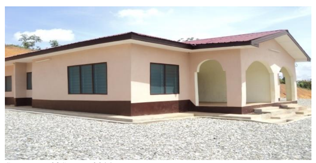
Figure 5: Ningo Teachers Quarters

It was found that, apart from classroom blocks, teachers quarters have also been built by GSWL in fulfilment of CSR activities in its catchment communities to serve as motivations for teachers to stay in the community to teach. Figure 5 is the picture of Teachers Quarters in Ningo Community.