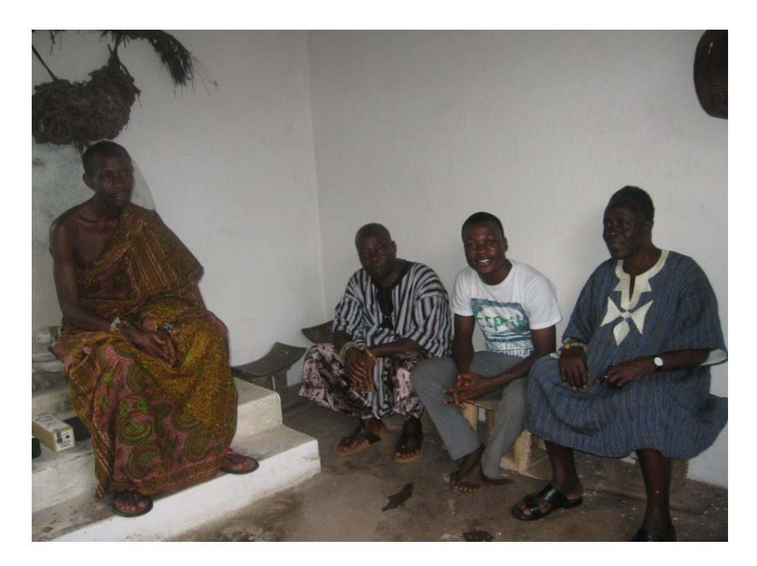
Plate 1: A Group Photograph Showing the Researcher and Some Shrine Functionaries at the Akonedi Shrine.

The above plate shows the researcher in a group photograph with some shrine functionaries. From the left is the Osofo of the Akonedi shrine, next to him is Okomfo Kyao, the researcher and finally Okomfo Tano.