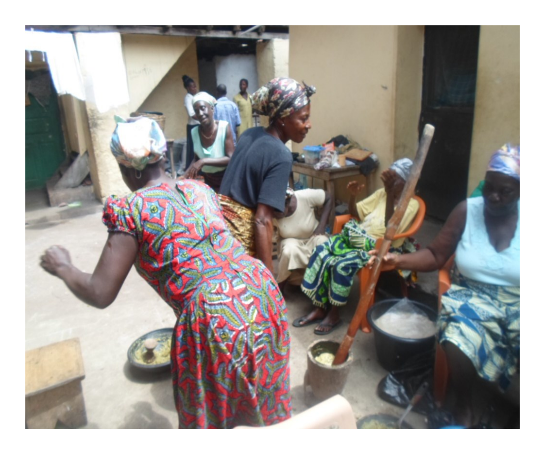
Plate 7: Joyous Moments of Ohum Festival.

The joy with which the food was eaten reveals the social dimensions of food. As was already discussed in the literature review, food creates social identity (see Ceccarini, 2010). For many scholars, a society's food habits mirrors its culture or traditions. The components of the culture are seen in the ideas associated with food. Coff (2006) posits that although food is often eaten on the individual level, it always carries with it a communal sense. Coff contends that during the shared meal time, people transcend their individual personalities and are united in a social interaction. This communal sense creates the notion of same blood, same flesh among the eaters. In this regard, the sense of 'egoism' is eliminated and the eaters find strength in a common identity (Coff, p. 4). One gathers from the above argument that food does not only expose the culture of a group, but it also serves as the bedrock for