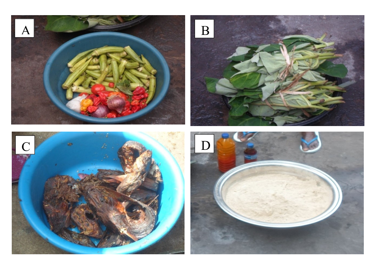
Plate 5: Ingredients For the Preparation of Pinpineso . (A) Shows a Bowl Containing Okro , Onions, Pepper, and Local Salt; (B) Shows a Bowl with Kontomire (Cocoyam Leaves); (C). Shows a Bowl with Smoked Fish for the