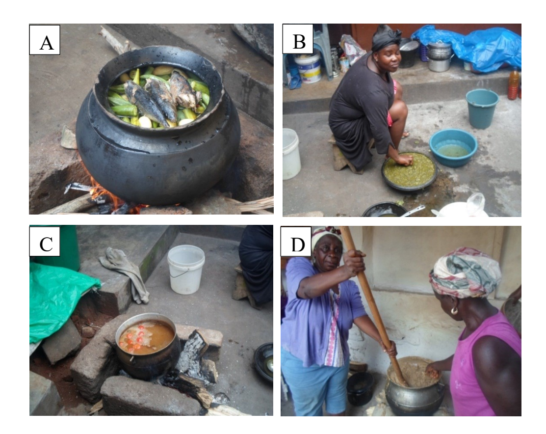
Plate 6: Preparation Stages of the Pinpineso . (A) Shows a Pot with Vegetables and Fish on Fire; (B) Shows a Woman Grinding the Cooked Vegetables in an Earthenware Bowl for Stew; (C) Shows the Soup Made With the Stock From the Vegetables and (D) The Preparation of eba Made From Roasted Corn Flour.

Preparation of Soup and (D) Shows a Bottle of Palm (Red) Oil and Container with Roasted Corn Flour.