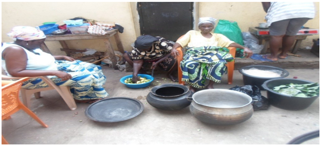
Plate 4: A display of Ingredient for the Preparation of Pinpineso

The picture below shows a well-endowed woman who by Ghanaian standards qualifies to be called an 'old lady'. She is resident in the house where the shrine of the Kyao god is situated in Larteh. As mentioned earlier prior to the preparation of the food, all the ingredients were placed in front of her for inspection.