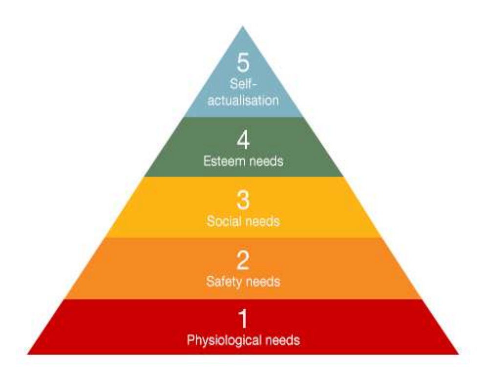
Figure 1: Maslow's Hierarchy of Needs

food, health needs etc. would consider first the need for these basic needs before satisfying these needs. This is the highest need of man and this is seen from the base of the diagram shown above.