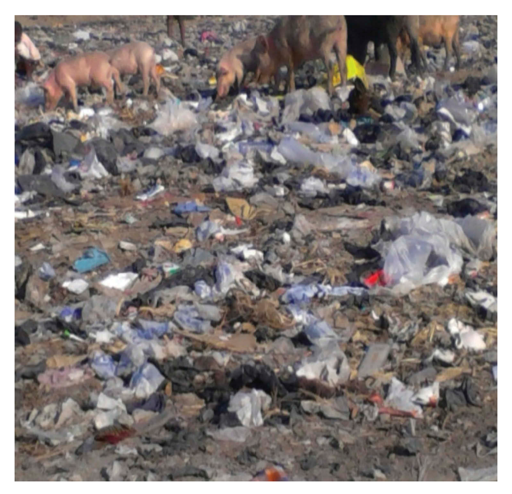
Figure 3. Pigs feeding on filth in the Benya Lagoon at Elmina.