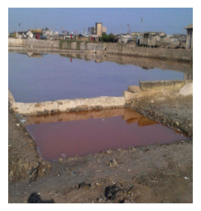
Figure 2. A salt pond at Bantuma.

The informant opined that, the sight of filth in and around the salt ponds might have psychological effect on some customers, which might discourage them from buying salt produced in such an environment. According to the informant, this could decrease demand for salt produced in the area, culminating in not only loss of income but employment as well. This proves the linkage and relationship between sanitation and salt productionassociated livelihood as implied by the sustainable livelihood theory. Another salt producer revealed that when it rained, the refuse and human excreta were washed into some of the salt ponds in spite of the walls that had been built around the ponds as embankment and protection as captured in Figure 2. This, according to the producer, is a threat to the patronage of the salt produced in the area as it affects the quality of the product.