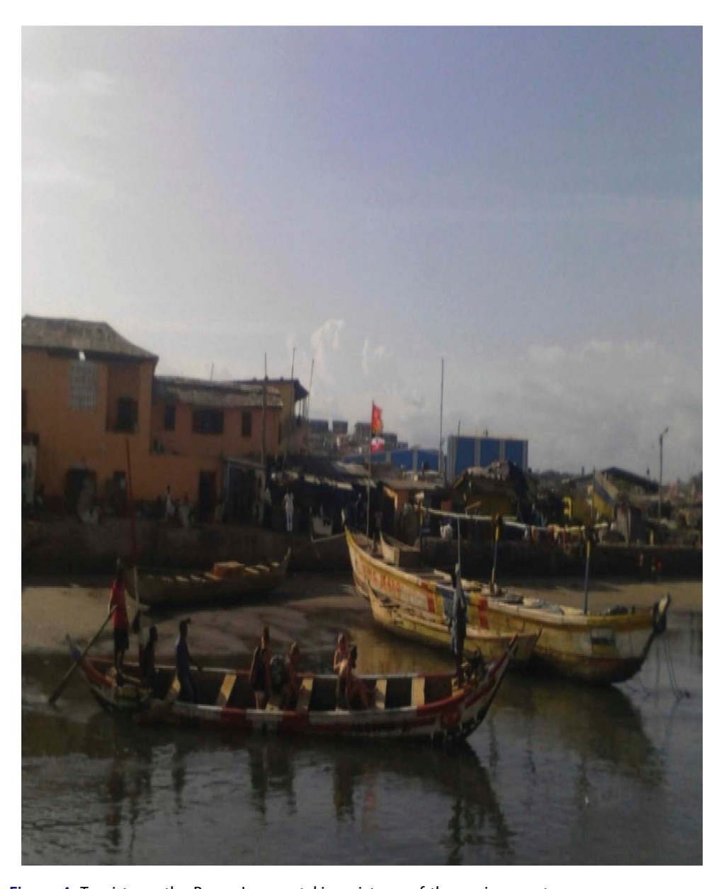
Figure 4. Tourists on the Benya Lagoon taking pictures of the environment.

Eshun, 2013). A key informant at the Museums and Monuments Department at the Elmina Castle and another at the Coconut Grove Hotel, Elmina, revealed in separate interviews that, tourists have been seeing and expressing disgust about open defecation and indiscriminate dumping of waste within certain portions of the study communities, especially around the castle and the Benya Lagoon. According to the informants, some of the tourists take pictures of the nasty scenes in the area (see Figure 4). It can be argued from this piece of evidence that the practice is an affront to the dignity of the people in the area and bad for tourism promotion for improved livelihood and sustainable development.