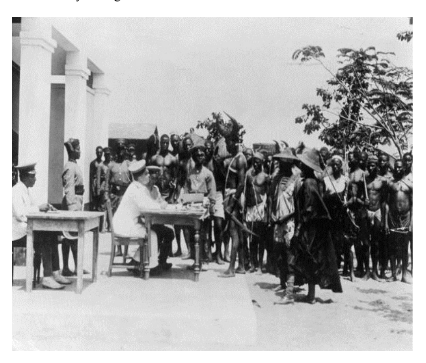
Fig. 1.4: British officers recruiting Togolese men into the "Volunteers Corps" in what was still officially German-controlled Togoland. August, 1914.

The Gold Coast Regiment was part of the West African Frontier Force and numbered nearly 10,000 soldiers. They played an important role in the invasion and take-over of the German colonies of Togoland and of the Cameroons, and in the war in East Africa. In total, 25,000 African soldiers served in the West African Frontier Force.<sup>36</sup> The majority of these men were recruited by the chiefs in both the French and the British colonies. France deployed some 250,000 West Africans during the First World War.