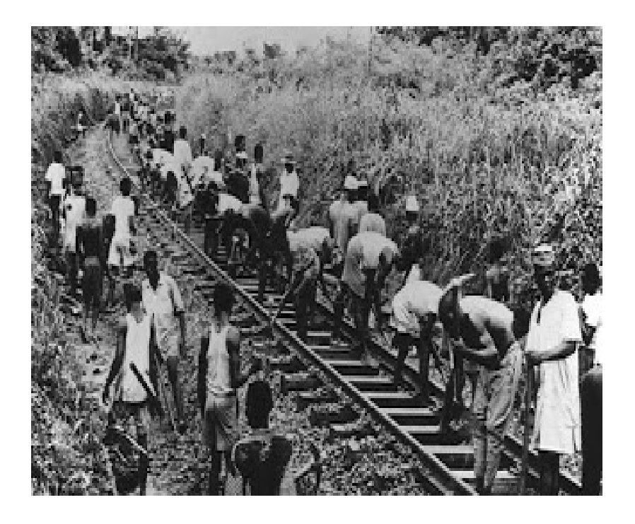
Fig. 1.3: Men constructing a railway line in Nigeria (forced labour).

Indeed, chiefs recruited many men as soldiers for both the French and British forces. The chief served as a propagandist, moving from one village to the other, convincing the people to recruit into the imperialist army. In the Gold Coast, the chiefs moved from one village to another, recruiting men into the colonial army to support the war effort. One important role of the chief in the French colonies was to enforce the mandatory three-year military service for male adults. These male adults had to serve in the French army during the First World War. In Senegal, they were known as tirailleurs . The British forces relied on the West African Frontier Force which was made up of Gold Coast, Nigerian, Sierra Leonean and Gambian troops in addition to some civil policemen, and the Senegalese tirailleurs stationed in Dahomey.<sup>35</sup> Below is a photograph