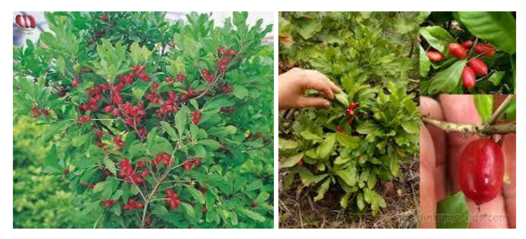
Figure 1: Miracle Berry Fruits

In 1919 the miracle berry was introduced into the United States by Fairchild (1931), founder of the Fairchild Tropical Gardens in Florida. Although it is nearly tasteless with a slight cherry-like flavor, the miracle berry alters the following taste of any sour- (essentially characterized as acidic) tasting food or drink into a perception of sweetness (Cagan, 1973; Inglett & Chen, 2011; Litt & Shiv, 2012). It modifies the overall flavor perception, for example, changing sour lemon juice into a sweet drink with a subtly altered lemon flavor. As previously stated, this taste-modifying function is due to the active substance found in the berry-miraculin.