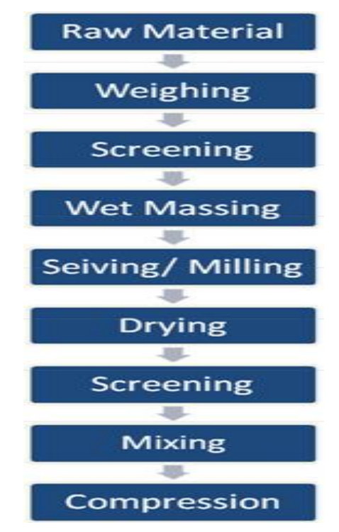
Figure 3: Flowchart for processing Steps in Wet Granulation powdered sachets