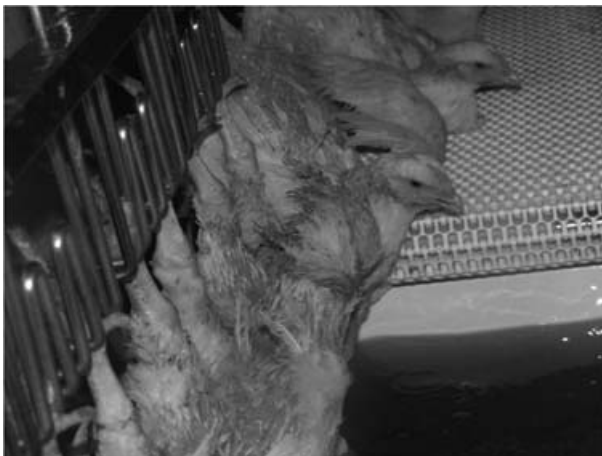
Figure 3 Breast support conveyor installed to support the weight of birds while they are shackled and inverted (Adapted from Lines et al. [22]).

during shackling and to support their body weight by using a conveyor which runs beneath the birds so that their breasts could rest on the conveyor (see Figure 3). The researchers found that its use significantly reduced the struggling of birds at the point of shackling and it also improved entry to the water bath.