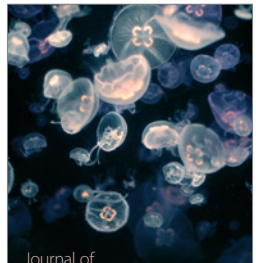
Journal of Marine Biology