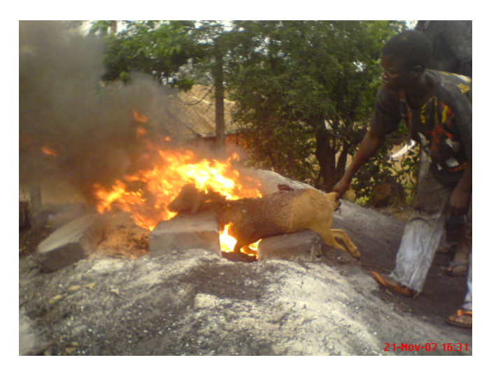
Figure 3. Singeing of goat in open fire fuelled with scrap tyres

Products Order, 1973). Thus, prior to singeing with the scrap tyres, the hides were already contaminated with unacceptable levels of Cd, Zn and Pb. This might be reflecting undue levels of heavy metal exposure in the local environment. The animals could potentially have picked heavy metals from the environment given the challenges of free-range grazing, scavenging in open waste dumps for fodder, drinking water from polluted drains and streams and exposure to atmospheric depositions especially from automobile fumes and open burning of solid waste. Indeed, close correlation have been reported between heavy metals concentration in cattle tissues with that in soil, feed, and drinking water (Qiu et al., 2008). Generally, toxic heavy metals such as Pb and Cd have slow rate of elimination such that harmful levels could accumulate in tissues after prolong exposure to even low quantities in the environment (Humphreys, 1991; Sharma et al. 1982; Doyle and Spaulding, 1978). The un-singed hides have levels of Cu falling within permissible limit of 20.0 mg/kg (Meat Food Products Order, 1973). With regards to Mg, Mn and Ni, it is unclear whether the background levels recorded in the hides may constitute significant problem to meat consumers; this is because of their role as essential heavy metals. As contaminants however, no MPL have been fixed for them in meat.