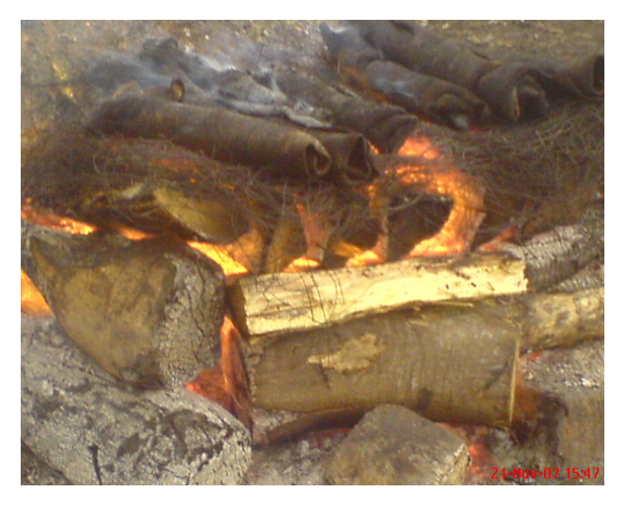
Figure 4. Singeing of cattle hides placed directly on metal stripes derived from burnt tyres (metal stripes are kept red-hot with minimum burning firewood)

The levels of heavy metals reported in the singed products were generally quite high when compared to reported cases of heavy metals concentrations in different meat products (Santhi et al., 2008; Koréneková et al., 2002). It appears that the substantial heavy metal levels in the un-singed hides contributed considerably to the overall high values recorded with singed treatment. This seems to suggest that other factors such as rearing conditions of animals, depicted by the relatively high levels of the metals in control hides, have also accounted for the quantum of heavy metals realised in the singed materials. Thus, the levels of heavy metals recorded in