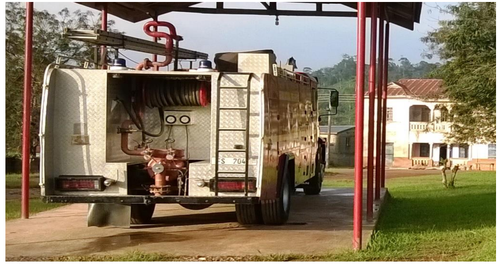
Figure 6: Fire tender provided by government after completion of fire station

Another infrastructural development was in the area of providing school infrastructure. In Aduamoa-Kwahu, the group undertook the role of providing prompt renovation and maintenance of school buildings in the area. The association does not have the financial strength to construct the schools and as such have taken over the maintenance of the building and sometimes extensions. This is also because the group offer prompt response than the