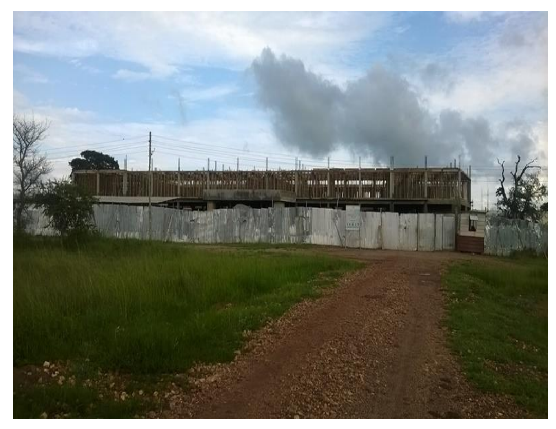
Figure 3: UCC CoDE Satellite campus under construction in Zuarungu, UE/R

I know a professor in my school, who in collaboration with the BONABOTO, is opening a campus of UCC in Zuarungu. (Male, Bolgatanga, age 30 years)