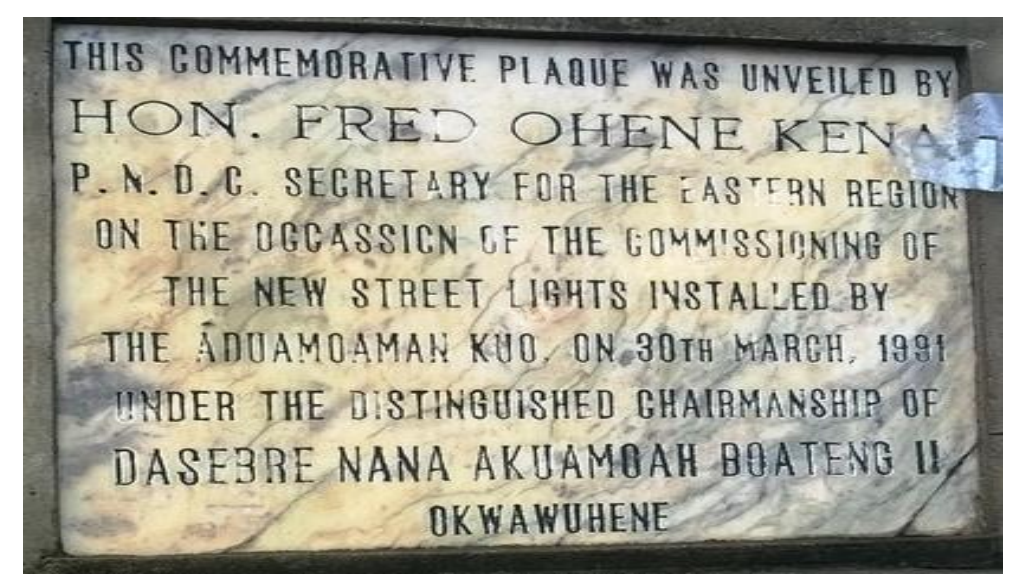
Figure 4 : Commemorative plaque for the installation of street lights in Aduamoa

The group was involved in tree planting, construction of KVIP, fire station, ambulance, and they also first brought street light to the community (they issued a plaque to that effect). The group established around the year 1991. The group has been of immense help to the Aduamoa community. The leaders of the society often call on us to either solve a social problem or construct something that is needed. (Male, Aduamoaman, age 50 years)