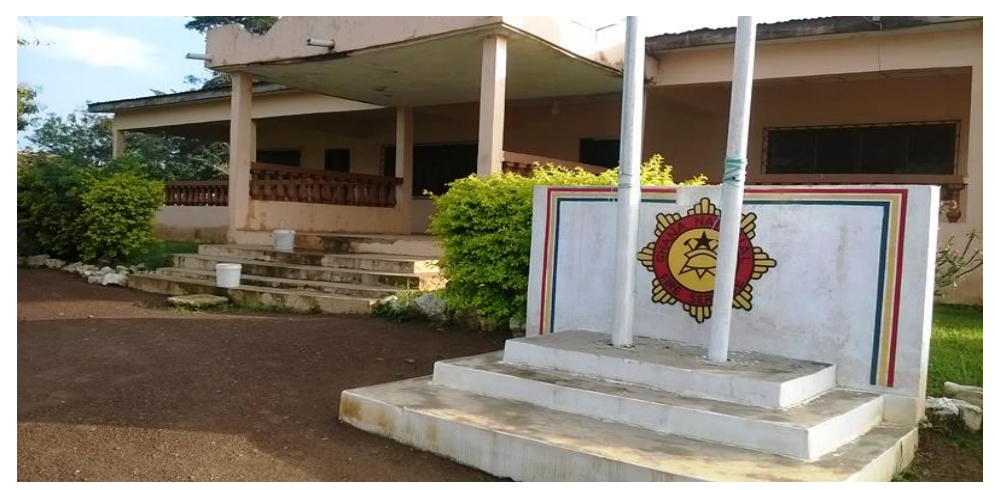
Figure 5: Fire station built by Aduamoaman in Aduamoa-Kwahu

through with the promise by providing a fire tender and other apparatus as well as the human resource to run the station. The community members reiterated that the project had immensely improved living in the community.