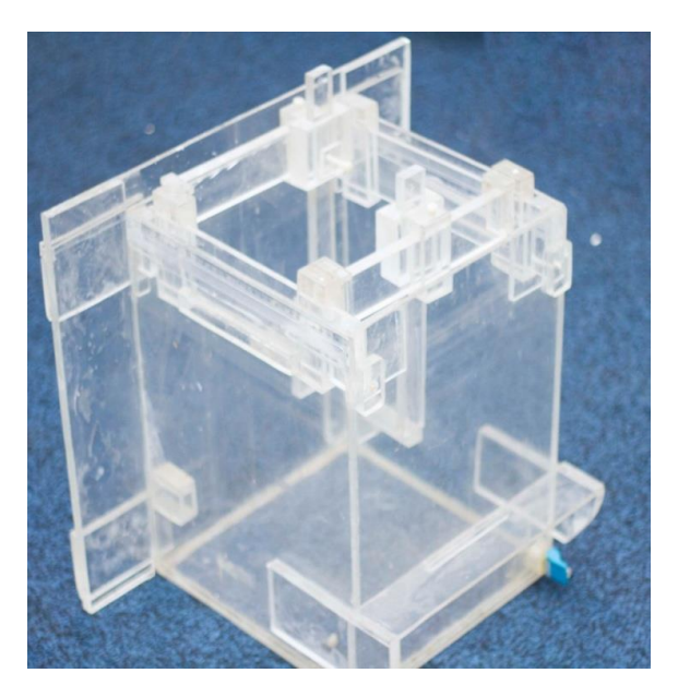
Figure 2: Cross sectional view of the locally constructed water phantom