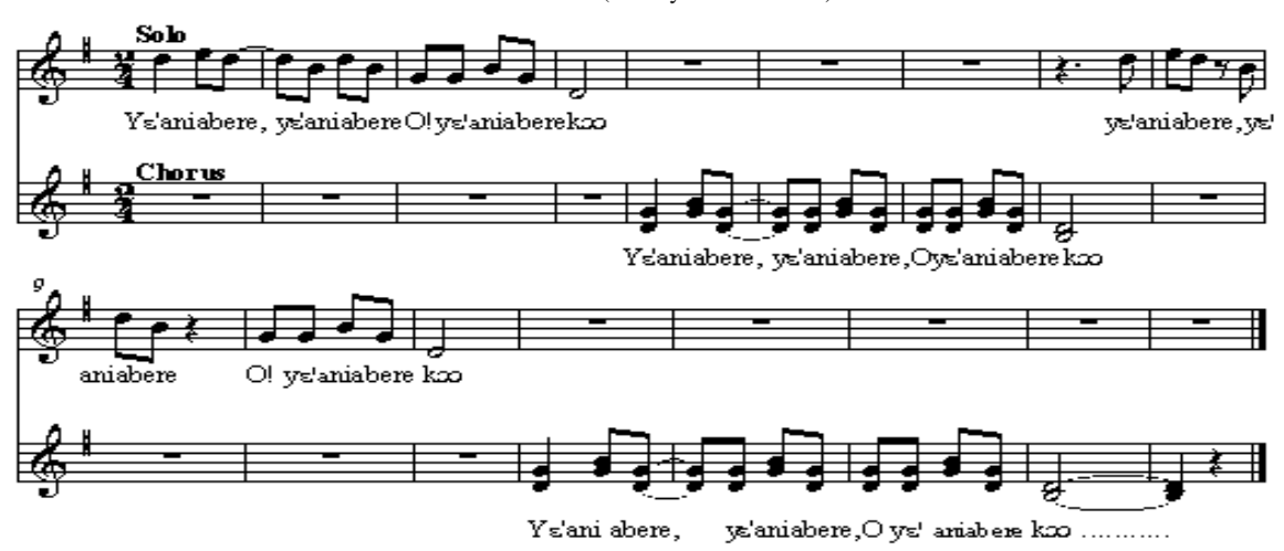
Figure 1. Song of protest titled, Ye' ani abere tcc composed in Twi, (a Ghanaian indigenous dialect).

Yε' ani abere kcc (Our eyes are red hot)