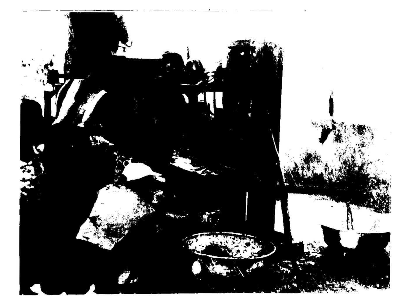
Figure 9: Photograph showing pressing of digested pulp to release crude oil.

The perforated cage with its contents is then introduced into the hydraulic press component of the equipment where pressing results in the release of crude oil into a collecting basin as shown in Figure 9.