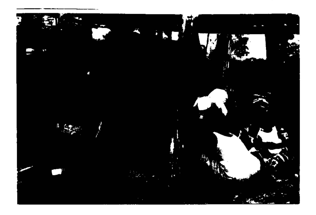
Figure 4: Photograph showing the use of diesel engine digester.