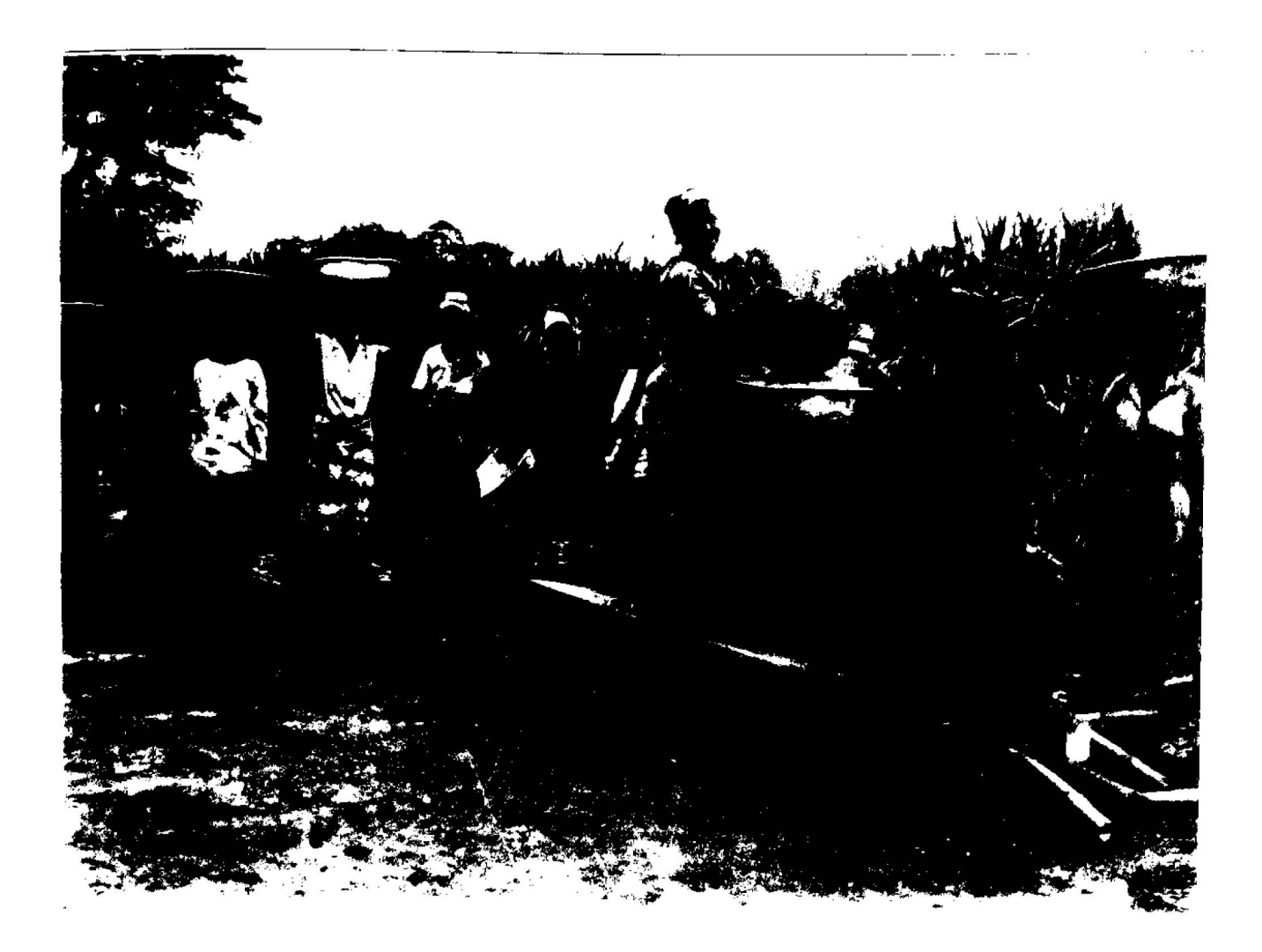
Figure 7: Photograph of collection of nalm truits from boiling tanks.

and press at the same time. This was used together with a boiling tank of 1ton of palm fruit capacity.