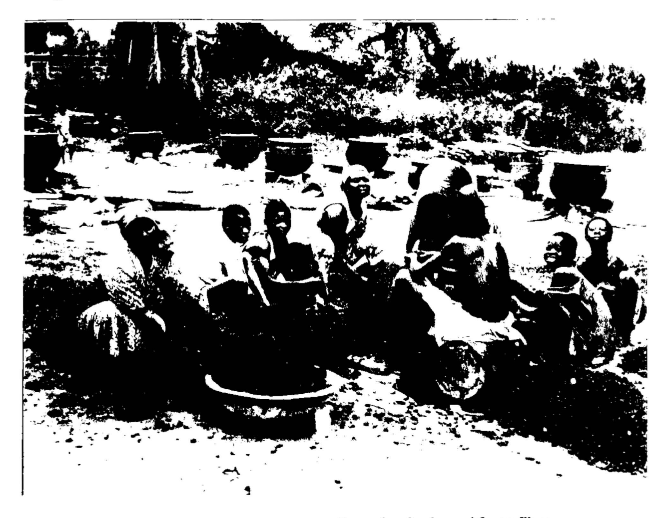
Figure 10: Photograph showing separation of palm kernel from fibre.

With the exception of the washing off method in Technology 1, all the other methods involve final separation of palm kernel and fibre as shown in Figure 10.