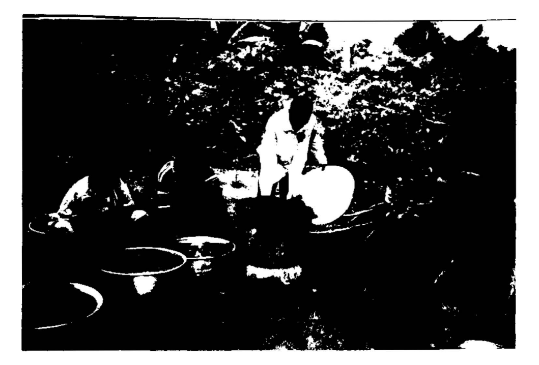
Figure 3:Photograph showing washing off to separate crude oil from fibre.

Out of the 30 respondents who adopted the mortar and pestle technology, 17 used the screw press whereas 13 used the washing off method to extract oil. Table 7 shows the number of years of adoption of Technology 1.