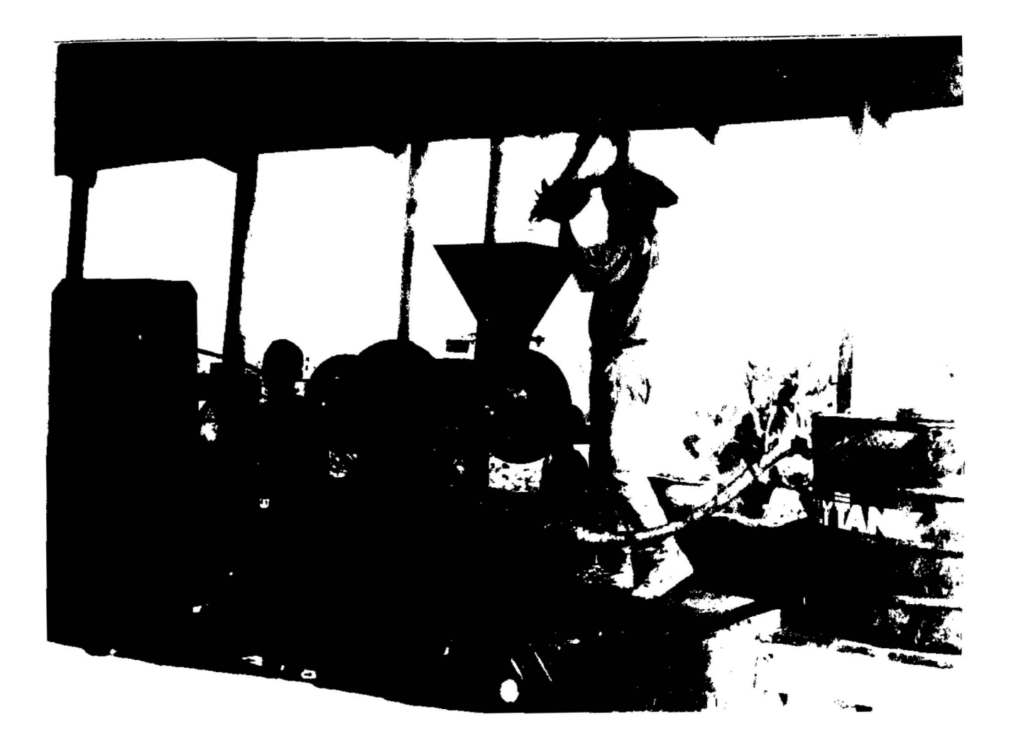
Figure 8: Photograph showing filling of hoper and the release of pulp from digester.

material was emptied into a perforated metal cage. Figure 8 shows the digester component of the equipment.