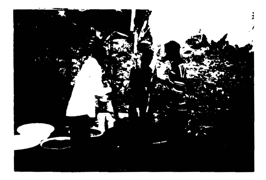
Figure 2 : Photograph showing the use of mortar and pestle to pound palm fruits.