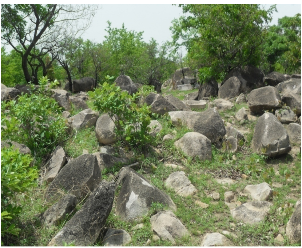
Fig.2. a view of the topography showing the undulating nature of the landscape, making the pursuit of slave raiders on horses difficult.

It does appear that, this song suggests how a victim could pretend to be running away into the bush, but in so doing, lures a slave raider into an unfamiliar terrain. The basic point in this strategy, as informants recounted, is that victims were often more familiar with the topography than their predators. The memories of these strategies suggest that subaltern groups did not always remain passive but devised innovative strategies to lessen the impact of captivity and to ensure that their entire people and cultures were not completely obliterated. In addition to the landscape, local architecture facilitated resistance against enslavement within these cultures.