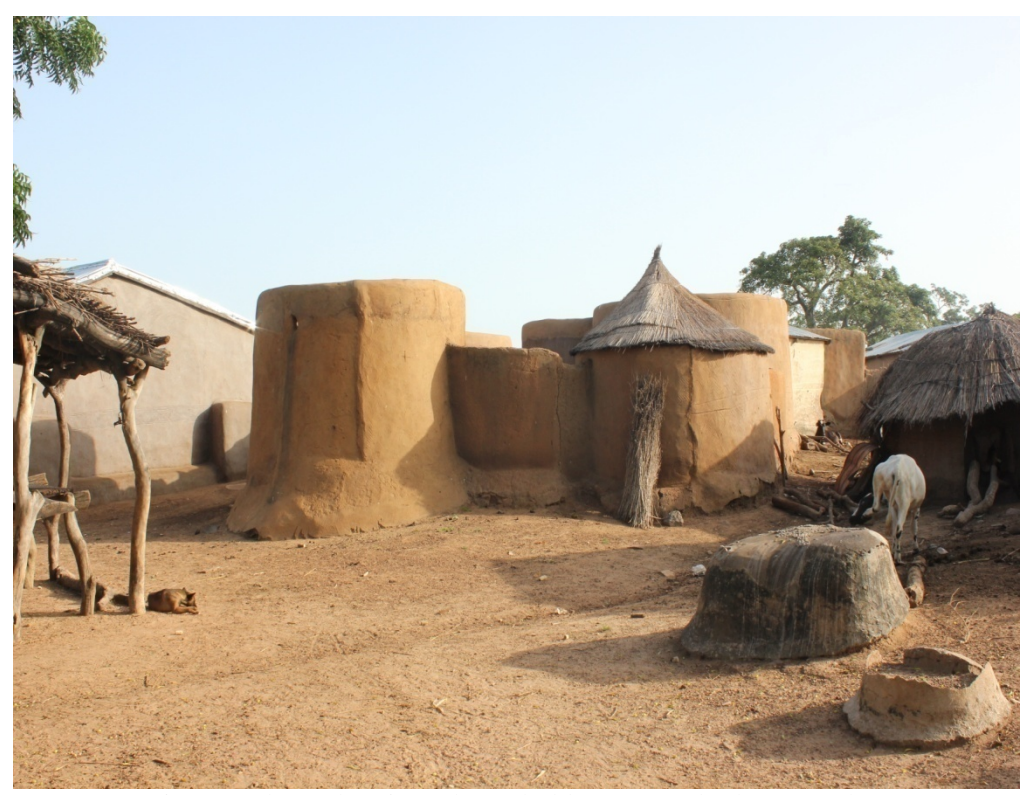
Fig. 4.A photo showing a household compound.

The architecture motif is significant in that we see a similar pattern within Bulsa and Kasena cultures, as it became one of the defensive strategies in how they resisted human kidnapping for enslavement. The chief of Nakong, Joseph Banape Afagache, from whose compound the photo in Figure 4 below was taken, recounted how, as a child, he was told of how raiders who terrorized their community were resisted by the innovative use of these building strategies. According to him, their houses were constructed such that they were practically impregnable and difficult for attackers to access. Although people are now beginning to design houses using modern models, in the past, the main building material was sand and clay mixed with cow dung, dry grass and water. These materials were mixed together and kneaded thoroughly before being used to build. A particular compound could comprise between three and six round shaped houses connected by a wall and a small entrance (as shown in Fig. 4).