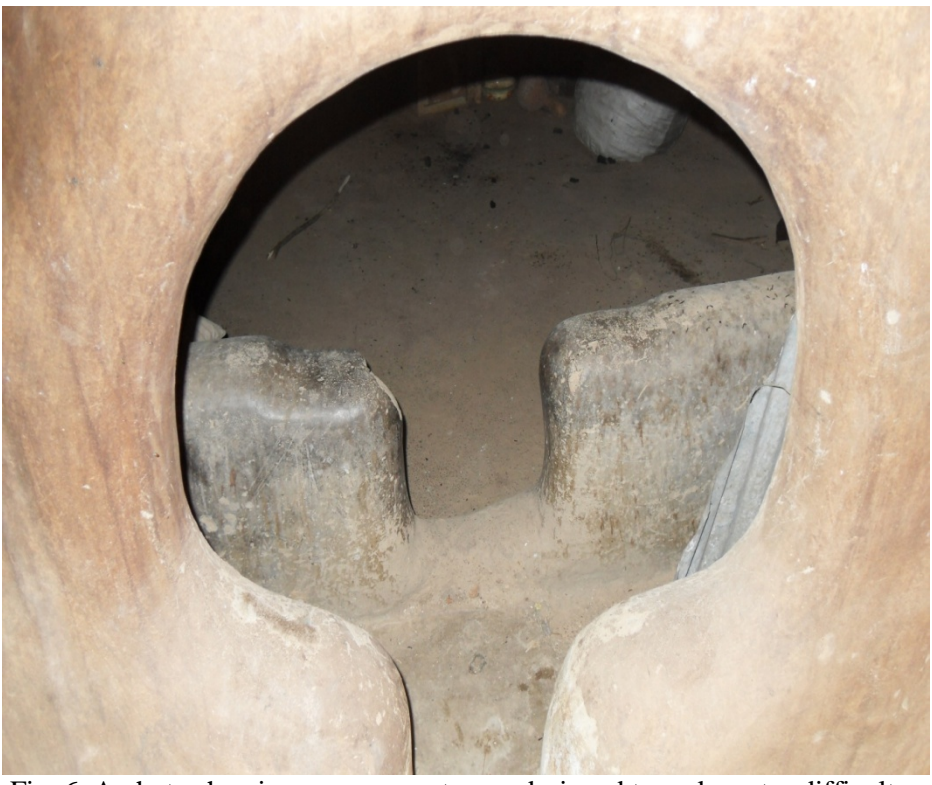
Fig. 6. A photo showing a narrow entrance designed to make entry difficult for people not familiar with the environment.