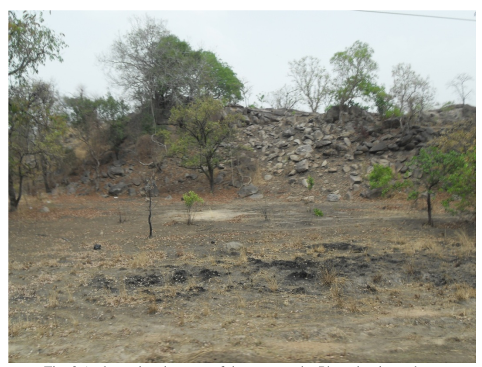
Fig. 3.A photo showing part of the topography.