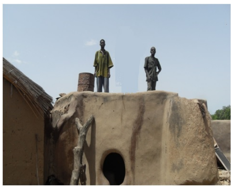
Fig.5 A photo showing how people were posted on roof tops to alert the community on the approach of slave raiders.