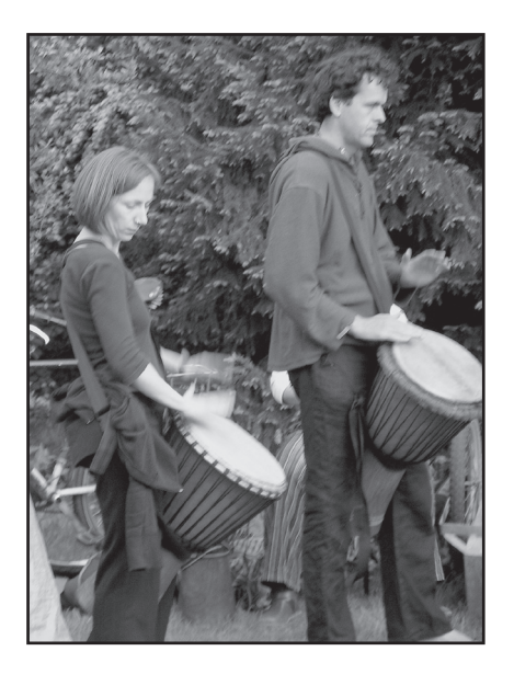
Figure 3. Amateur jenbe players at Berlin's Karneval der Kulturen , May 2005.

coalitions of musical form" (ibid.). Such a perspective actually presupposes a less monolithic, more performative and strategic notion of power as it has been prominently developed by Michel Foucault (1979) who remarks that "power is exercised rather than possessed" (ibid.:26). In the following, we therefore have to complement the structural analysis of the representations of African music with an examination of strategic uses of representations by various social agents operating within the networks of the Afro scene.