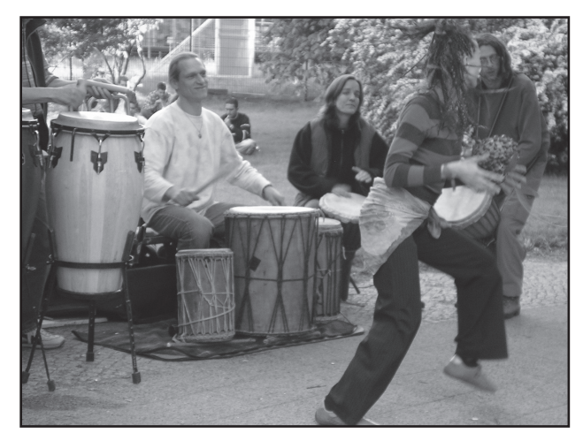
Figure 2. Performance by an amateur dance-drumming group on the fringe of Berlin's Karneval der Kulturen , May 2005 (photo by the author).

Given the importance of face-to-face interaction and active participation in musical performance within the Afro scene, I suggest that in the following we reconsider forms of representation on the level of musical practice and social interaction. As Straw reminds us, "the crucial site" of "the politics of popular music" is found "neither in the transgressive or oppositional quality of musical practices and consumption, nor uniformly within the modes of operation of the international music industries" (1997:504). With regard to social interaction within musical scenes, he urges us to focus on those "processes ... through which particular social differences ... are articulated within the building of audiences around particular