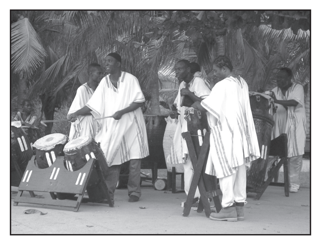
Figure 5. Mustapha Tettey Addy performing with The Obonu Drummers, Kokrobite, Ghana, January 2005.