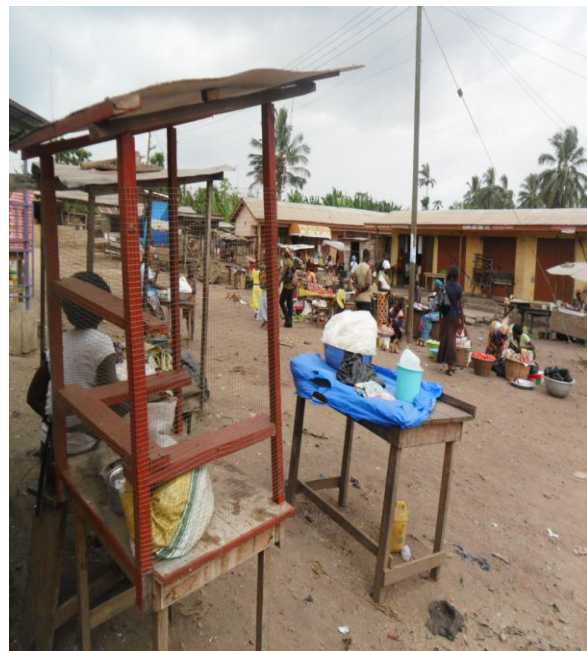
Plate. Showing the condition of the police station and the market respectively