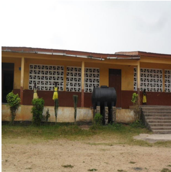
Plate 2. The condition of the School

“The market is not good at all. The sellers are also not helping. They prefer to transact business on the roadside instead of the market which is very risky and can result in fatalities. The refuse dump site is located just around the market as such when it rains we face several problems. Also there is no place of convenience in the market”.