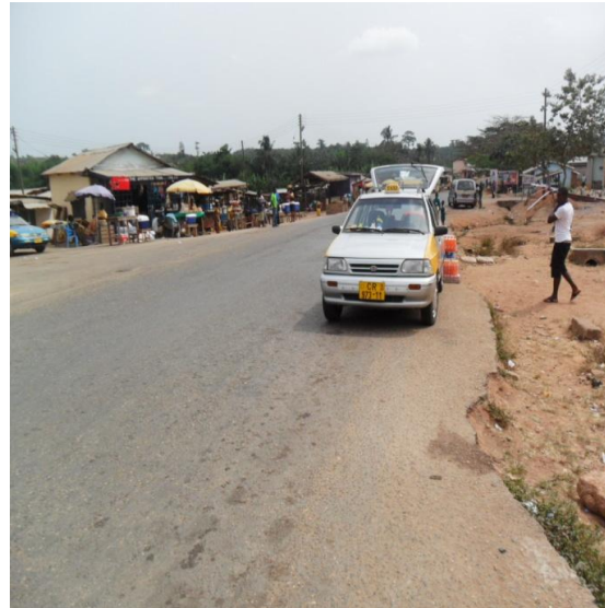
Plate 3. Section of the main road with people selling