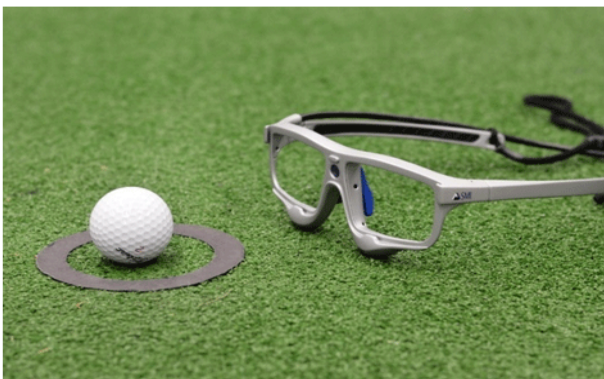
Figure 4: Eye tracking glasses.

For example, EEG biofeedback /neurofeedback can be used to train athletes by altering brainwaves through on board computer screen display (Figure 5). Two recent research investigations have assessed the patterns of cortical activity that influence successful golf putts, with findings forming empirical grounds for new neuro feedback interventions [20,21]. Patterns of EEG activity as per holed putts and missed putts were compared among expert and novice golfers. For instance, Cooke et al.'s findings suggested that expert golfers experienced a greater reduction in high EEG alpha power than novices, and that holed putts were characterized by less high-alpha power than missed putts at frontal and central sites (e.g., Fz, F3, F4, Cz) in two seconds before movement [21]. Similar results have been found in other self-paced voluntary movements investigations where EEG power was reduced in both hemispheres of the brain during bimanual tasks [22]. Therefore, EEG biofeedback serves as a powerful technique to help minimize or discard attention related problems, competitive anxiety and anger experienced by elite athletes. These goals could be achieved through perceptual-cognitive skills such as concentration, decision making, stress management and regulation of anxiety, and other emotional related problems through self-regulation [23].