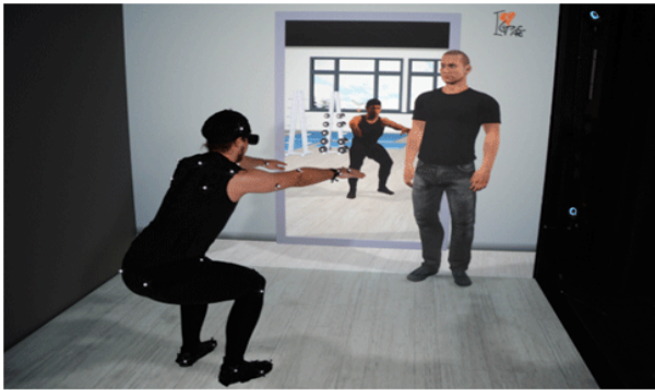
Figure 1: Virtual reality for sport exercises training.

accessed from multisensory components, audio-visual aids, actuators (types of motors used for moving or controlling mechanisms), and virtual actors. These measurements are recorded at different rates and synchronized to provide useful information on athletes' movements. Athletes' perspective and behavior within a VR/AR environment could then be related to