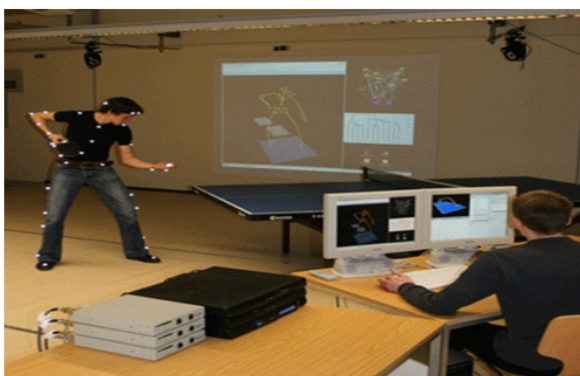
Figure 3: Augmented reality for table tennis.

their perspective and behavior in real-life environments (Figure 1,2,3). Space precludes vivid descriptions for all the figures. For example, figure1 depicts a teacher-trainee scenario where