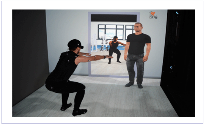
Figure 1: Virtual reality for sport exercises training.

accessed from multisensory components, audio-visual aids, actuators (types of motors used for moving or controlling mechanisms), and virtual actors. These measurements are recorded at different rates and synchronized to provide useful information on athletes' movements. Athletes' perspective and behavior within a VR/AR environment could then be related to