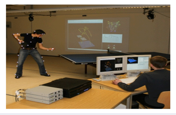
Figure 3: Augmented reality for table tennis.

their perspective and behavior in real-life environments (Figure 1,2,3). Space precludes vivid descriptions for all the figures. For example, figure1 depicts a teacher-trainee scenario where