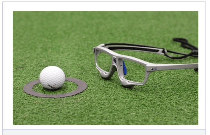
Figure 4: Eye tracking glasses.

For example, EEG biofeedback /neurofeedback can be used to train athletes by altering brainwaves through on board computer screen display (Figure 5). Two recent research investigations have assessed the patterns of cortical activity that influence successful golf putts, with findings forming empirical grounds for new neuro feedback interventions [20,21]. Patterns of EEG activity as per holed putts and missed putts were compared among expert and novice golfers. For instance, Cooke et al.'s findings suggested that expert golfers experienced a greater reduction in high EEG alpha power than novices, and that holed putts were characterized by less high-alpha power than missed putts at frontal and central sites (e.g., Fz, F3, F4, Cz) in two seconds before movement [21]. Similar results have been found in other self-paced voluntary movements investigations where EEG power was reduced in both hemispheres of the brain during bimanual tasks [22]. Therefore, EEG biofeedback serves as a powerful technique to help minimize or discard attention related problems, competitive anxiety and anger experienced by elite athletes. These goals could be achieved through perceptual-cognitive skills such as concentration, decision making, stress management and regulation of anxiety, and other emotional related problems through self-regulation [23].