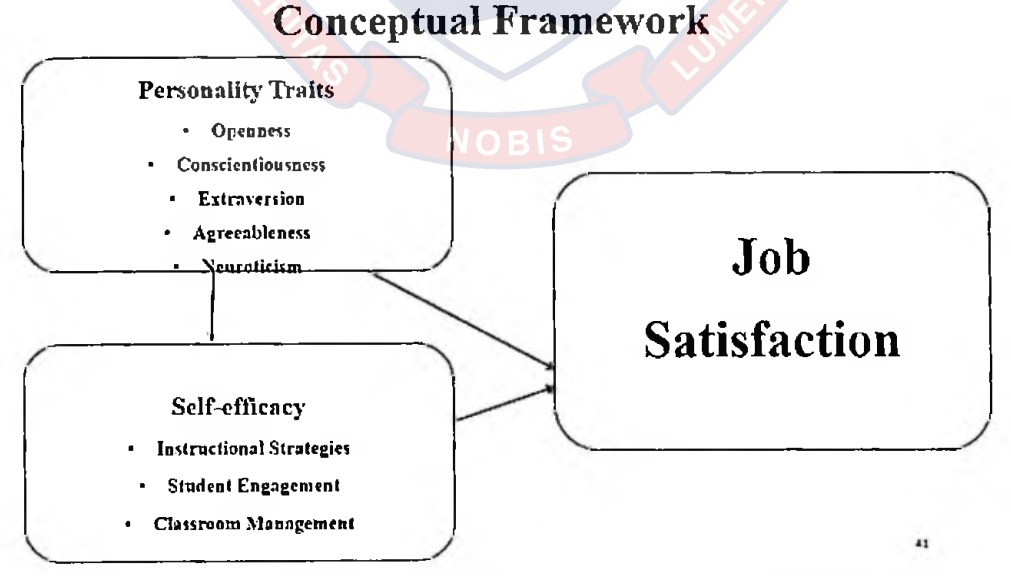
Figure 1: Conceptual Framework on Influence of personality traits, self-efficacy on the job satisfaction of junior high school teachers in Awutu-Senya West District.

The fifth and last personality dimension, according to Costa and McCrae (1992) is Openness to Experience. Openness to experience includes the following: active imagination, aesthetic sensitivity, and attentiveness to inner feelings, a preference for variety, intellectual curiosity and independence of judgment. People scoring low on Openness tend to be conventional in behaviour and conservative in outlook. They prefer the familiar to the novel, and their emotional responses are somewhat muted. People scoring high on Openness tend to be unconventional, willing to question authority and prepared to entertain new ethical, social and political ideas. Open individuals are curious about both inner and outer worlds, and their lives are experientially richer. They are willing to entertain novel ideas and unconventional values, and they experience both positive and negative emotions more keenly than do closed individuals.