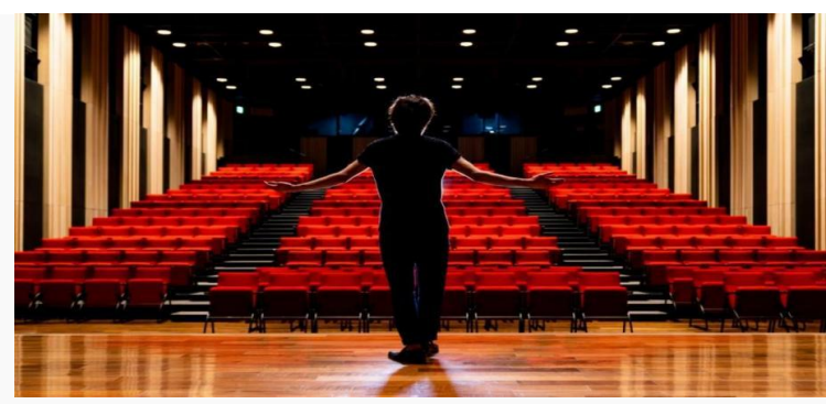
Theatre in a Pandemic