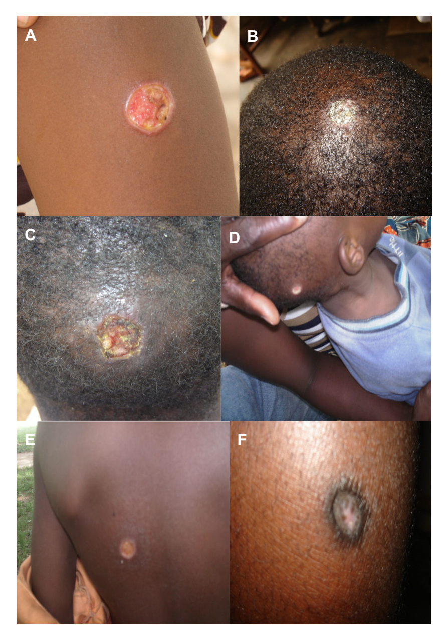
Fig. 2. Appearance of lesions from confirmed cases of human cutaneous leishmaniasis. Examples of typical active lesions are shown on several participants: (A) arm; (B–D) head; and (E) back. (F) An example of the scar developing in a healing lesion.

et al., 2007). More work is required to see if any pattern or significant variation of lesion form emerges in Ghana. The number of lesions per person ranged from 1 to 3, and no multiple diffused lesions were observed on any of the participants. In all, a total of 51 lesions were found on confirmed cases; of these 33 individuals had single lesions, six had two lesions and two had three lesions. The average size in diameter and reported age of the lesions (according to the participants) were 11.1 mm and 3.9 weeks, respectively. The sites of the lesions were classified into five regions and approximately half (53%), were located on the head (Supplementary Table S2). This could simply mean that the vector preferred uncovered parts of the body, consistent with the fact that the vector, if active at night, will bite the exposed head parts, since people will typically cover the body but not the head when asleep, or it may be due to some behavioural property of the vector. There were no reports of severe clinical symptoms accompanying the lesions, there were a few reports of low grade fever, and slight pain