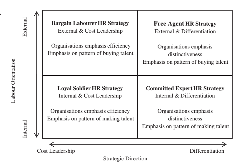
Figure 1. The four HR strategies.

goal of this approach is to find the one best way of solving a given people management problem. The universalistic approach identifies a bundle of practices that appears to be generally beneficial, and also sends the message that management cares about employees. The contingency approach, on its part, seeks to align human resource practices with competitive business strategies. One peculiar feature of this approach is its focus on cost leadership vs. focus on differentiation. The approach is mainly concerned with cost reduction, emphasising processes and general rules. As a result, appropriate behaviours for performing work are carefully prescribed. Organisations that focus on differentiation seek to promote innovation and quality enhancement. They show much interest in career development as a means of achieving good business results.