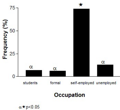
Figure 3: Distribution of the occupations of the studied participants