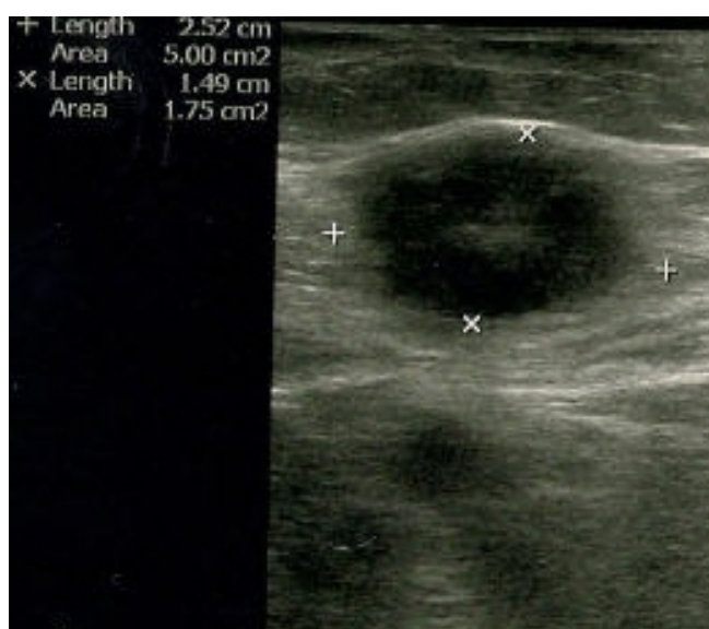
Fig 1: Grey-scale ultrasound image of the anterior abdominal wall showed the hypoechoic intramuscular lesion

Ultrasound of the anterior abdominal wall (figure 1) was performed and showed a predominately hypoechoic intramuscular lesion measures 2.5x1.5 cm in the left lower quadrant underneath the left end of the surgical scar. Internal echoes were noted in this lesion. The inner margins of the lesion showed some irregularity. However, there was no speculation or invasion through