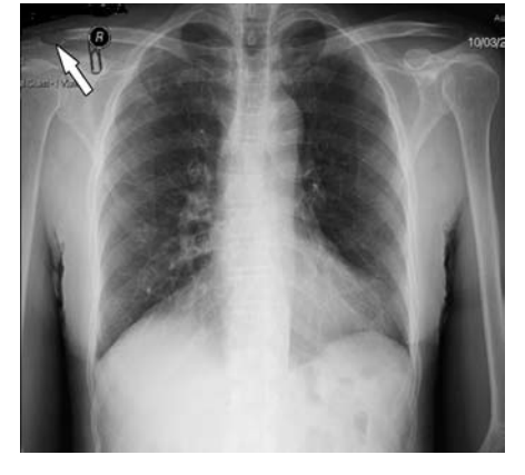
Figure 2 - Chest x-ray showing fractured right clavicle.